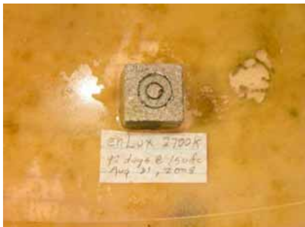
Figure 2. The enlux 2700K lamp grew almost nothing on the limestone cube and supported a thin skim of biofilm on the bottom of the container. The ring is where a washer shaded part of the upper surface.

I was concerned about the effect on lampflora growth of going from one blue chip in the 2050K lamp to three in the 2700K lamp, and so set up another bench test in my basement (Figure 1). The test ran for 92 days constant at about 150 foot candles; brightness ranged from 142 fc to 150 fc. Temperature ranged from 61F to 74F. Results were better than I expected (Figures 2-4). The 2700K lamp grew slightly more algae than the 2050K lamp, but far less than the white compact fluorescent lamp used as an experimental control. For a real world test, the 2700K lamp will go to Great Basin National Park to be tested in Lehman Caves. This is part of the multi-park lighting test that also includes Wind Cave, Carlsbad, Crystal Cave (SEKI), and Mammoth Cave.