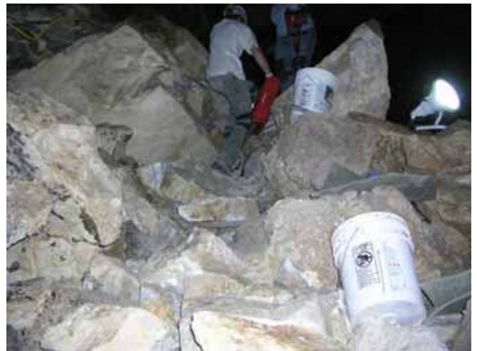
After photo: A portion of the trail in the Talus Room of Lehman Cave that has been removed. June 2008.

The trail section, through the West Room and Talus Room, has been permanently closed since 1981 due to safety concerns about rock fall. The physical deterioration and chemical decomposition of the trail and lighting system significantly threatens cave natural resources by disrupting cave processes, harming cave biota, and adversely impacting water quality. The trail also presents a safety hazard to park visitors and increases the potential damage to cultural and natural resources if visitors leave the normal tour route. The trail is being removed with power and hand tools, loaded into 5 gallon buckets and then hauled out of the cave in wagons. The trail consists of a base layer of rubble, a layer of sand/dirt (the original trail), an asphalt layer, and then a concrete layer.