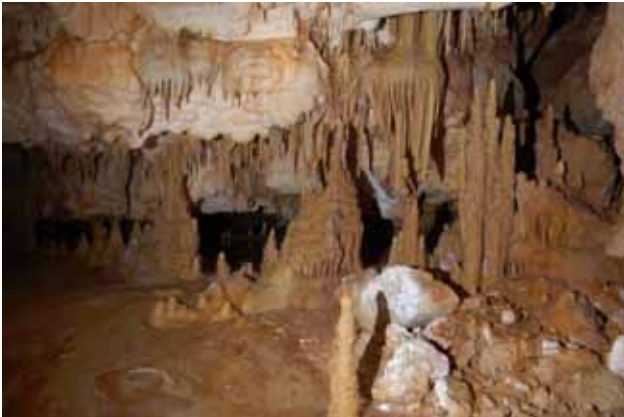
Formations in KyPet Caverns.