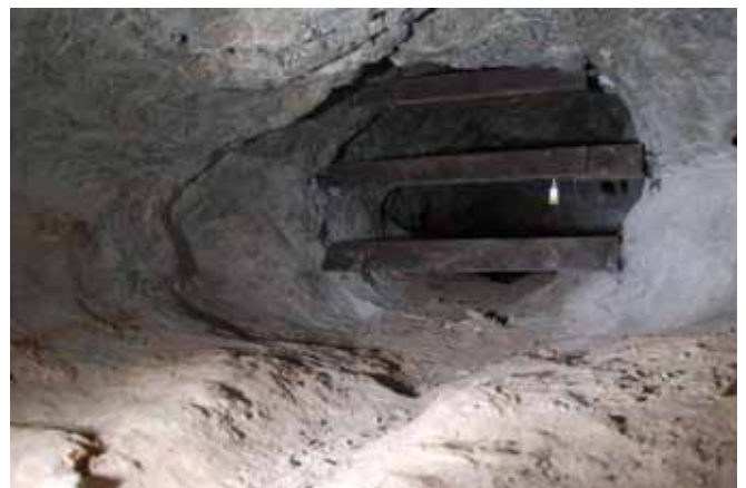
The completed bat gate on KyPet Caverns.

Due to the high daytime temp, we ended up working late at night and finished the gate at almost midnight on Saturday.