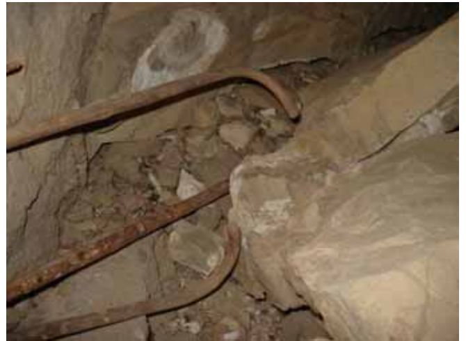
Native American wooden hooks found in Chamberpot Cave. Hooks were used to pull rabbits and other animals out of their burrows.