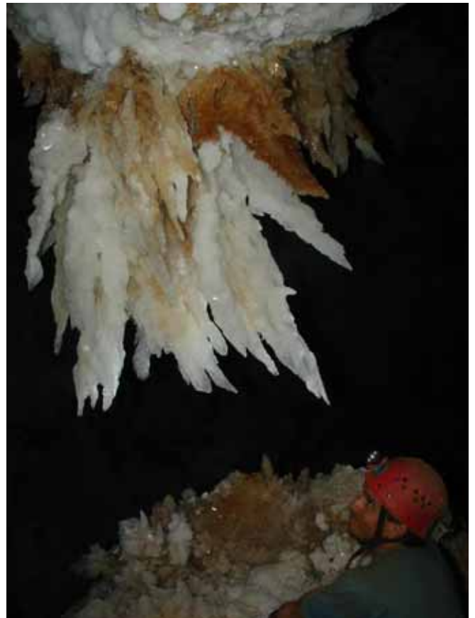
Close up of John Lyles admiring some of the gypsum chandeliers found in the Northern Lights area in the Far East area of Lechuguilla Cave.