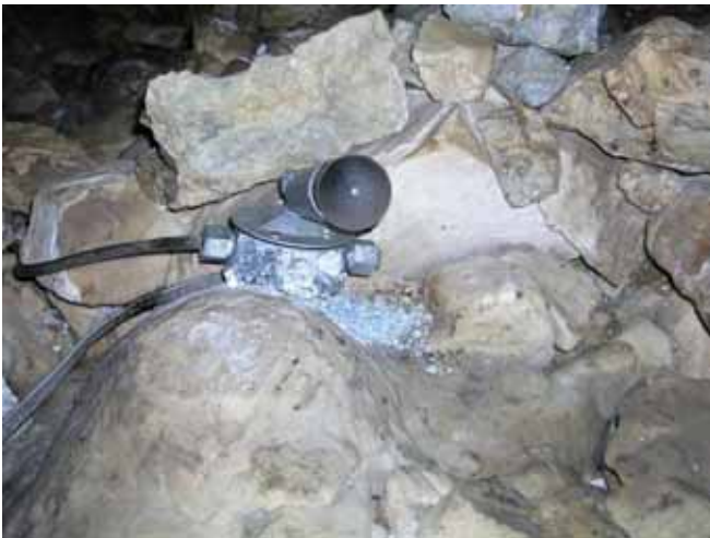
Example of the impact from the old lighting system in the Talus Room of Lehman Cave. June 2008.

Great Basin National Park began work this summer to restore nearly 4,700 square feet of cave floor in Lehman Cave to a pre-disturbance condition. Restoration will be accomplished by removing 1,800 feet of unused electrical system and 800 feet of paved walkways.