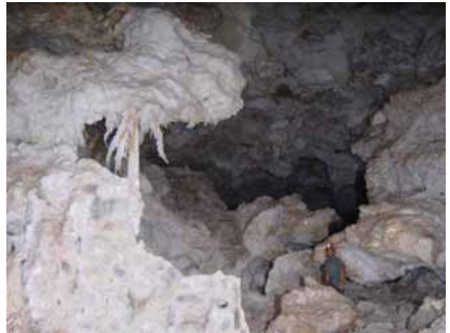
John Lyles looks at some gypsum chandeliers located in the Northern Lights area, a room that soars over 170-feet high into an area they named Mount Washington. These are the first chandeliers discovered in the Far East section of Lechuguilla Cave.

You can find more information on Lechuguilla Cave in the park-generated Lechuguilla Newsletters which can be found at: http://www.nps.gov/cave/naturescience/lechuguilla_cave.htm