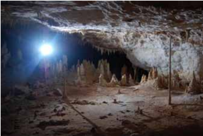
Formations in KyPet Caverns.

Neither of us were well equipped for caving because we did not expect to actually find anything, so it was to our relief that the cave turned out to be quite large with all walking passages. The passage soon turned into a series of large rooms and great leads that were extremely decorated. We quickly realized we found something nice and retraced our steps back towards the entrance, where we got sidetracked by the right-hand passage, which was beckoning us too. We had to at least take a peak. This passage ended up being full of rimstone pools, large emerald green pools, and every type of formation that you can imagine. As a result, we were sort of walking on eggshells. After 500 feet or so, we turned back and headed out.