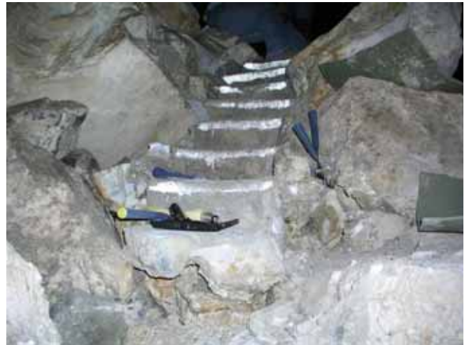
Before photo: A portion of the trail in the Talus Room of Lehman Cave that is being removed. June 2008. (NPS photo).

An interpretive component will reach and inform park visitors about the project and the need to protect natural and cultural cave resources.