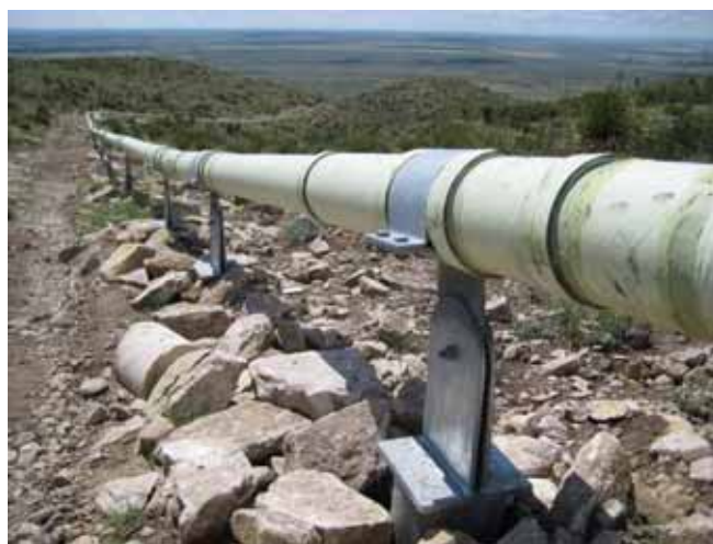
The new above ground sewer line installed so it is not on top of the Left Hand Tunnel and Bat Cave in Carlsbad Cavern.

sewer line is above ground so that it will be easier to detect and repair any future leaks. The buried section of sewer line between the Bat Cave lift station and the visitor center was also replaced with double walled sewer line. The collection lines from the offices and housing north of Bat Cave draw are also aging and are planned for future replacement.