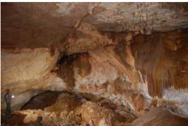
A corner of the largest room in KyPet Caverns.

KyPet Caverns is a large, highly decorated cave with a very large body of water. The largest room yet found measures 200 x 300 feet with an average ceiling height of 40 feet which also contains an impressive 40+ foot wall of draperies.