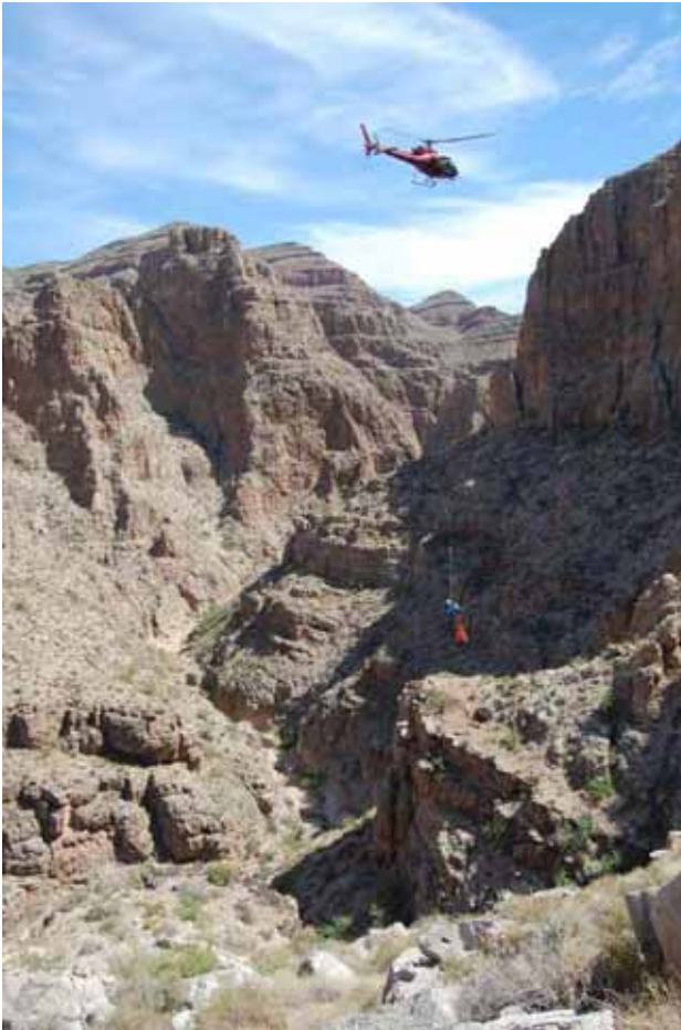
The helicopter hauling gating supplies to KyPet Caverns.

In 2005, the Parashant National Monument started a cave ecological inventory with the hopes of identifying the invertebrates that live in and use our caves. To our surprise, the very first sample of inverts produced a new genus of cave cricket and couple of new species of other inverts. Due to this little discovery, we leveraged more money to continue our work.