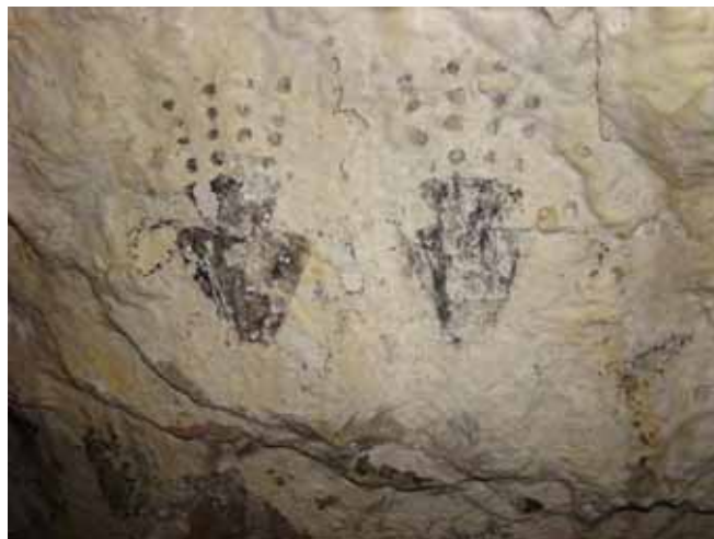
Native American pictographs found in La Cueva de los Dos Manos Negros.

The cave inventory project that was started in 2005 in Parashant National Monument has continued, with many significant biological and cultural discoveries having been made. After the initial discovery of a new genus of cave cricket and a couple of new species in 2005, the inventory project has been expanded. When we started, we had about 140 known caves in the area and we now have 271 documented caves. Although, we have only inventoried a very small portion of the known caves, the inventory has yielded 1 new genus of cave cricket, 1 new genus of psocoptera, 1 new genus of millipede, and 15 other new species.