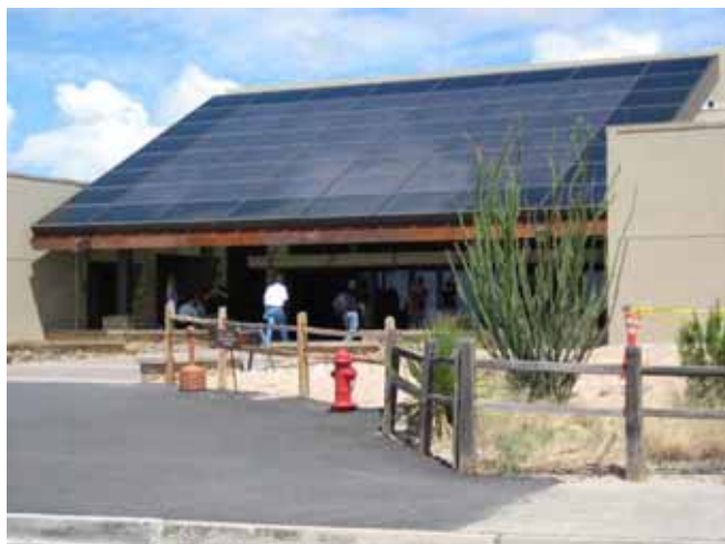
The new solar panels on the completely remodeled Carlsbad Caverns Visitor Center.

The 9-million dollar project that began in May of 2007 is essentially complete. The aging visitor center was completely gutted and rehabilitated with a modern and efficient heating/cooling system and solar panels. As of August 2008 there are items on the contractor's check list to fix, but visitors and staff are now using the new visitor center.