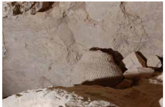
Small basket found in La Cueva de los Dos Manos Negros.

We just received the C-14 dates for these artifacts. The oldest was 3,500 BP and the rabbit snare was