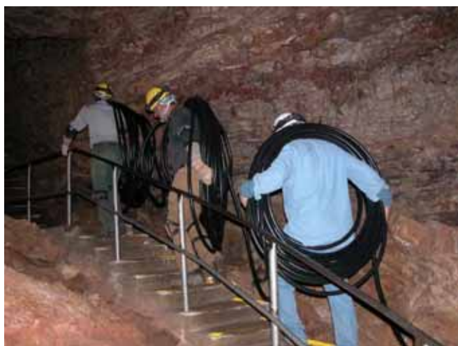
The first three of a twelve-man crew who hauled the 480-volt primary feeder cable into each of the three main tour routes in Wind Cave. Each coil slung over the shoulders of this crew weighed 100 pounds each.

used LED and compact fluorescent lights in this new system. This lighting system has reduced energy consumption by 70%, reduced impact from visitors and maintenance changing bulbs, nearly eliminated algae, and increased safety by adding trail lighting to the stairs. The lights were also placed on circuits so that our Interpreters could turn lights on and off, ahead of and behind their tours. We ended up placing 305 new lights along this established tour route. We will be working on the Natural Entrance and Garden of Eden Tour Routes this upcoming winter and adding a new tour, an 800-foot long tour known as the Blue Grotto Loop. This undeveloped route was formally part of the Candlelight Tour Route. This route will have its trail concreted and then the walls will be cleaned using cave restoration techniques to remove many decades of dust, before it is opened up as a lighted tour. We feel that this new route will be a spectacular new tour.