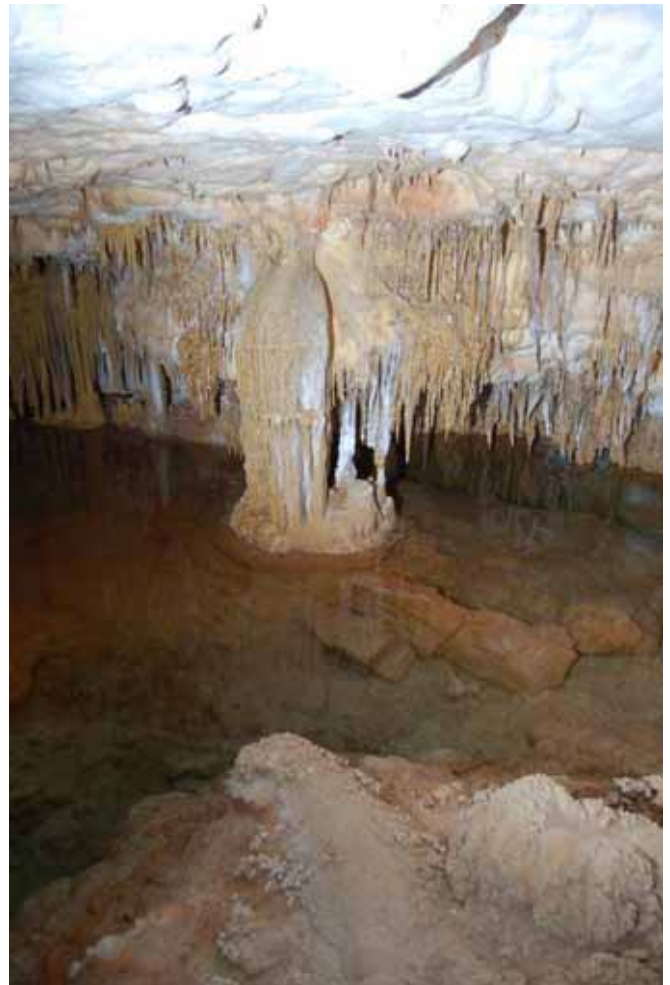
A corner of the lake in KyPet Caverns.

reached the end of the lake yet, so it may be much bigger.