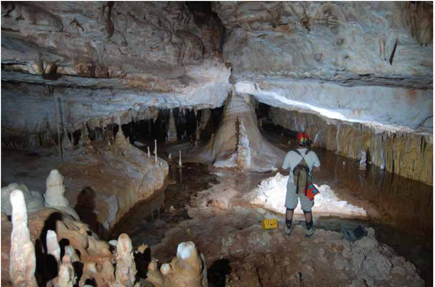
Caption: The lake in the newly discovered KyPet Caverns in Grand Canyon-Parashant National Monument. As of the date of publication of this newsletter, no one has ventured past the caver seen in this photo. Many leads remain in this exciting new discovery.

A Newsletter of the Cave & Karst Programs of the National Park Service