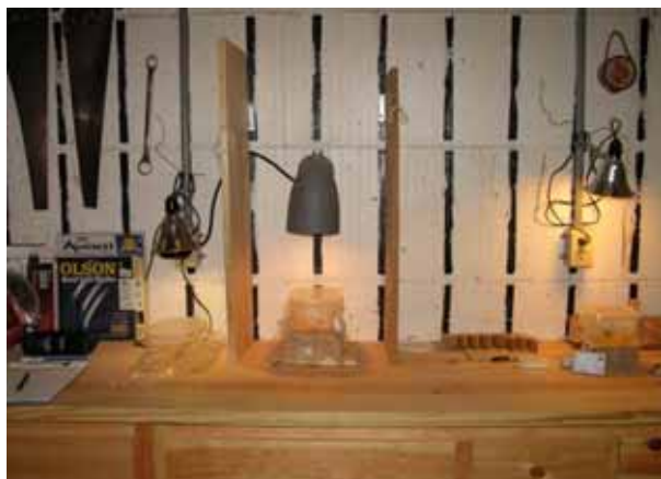
Figure 1. Latest bench test May 31-August 31, 2008. The enLux 2700 K lamp is at left, enLux 2050 lamp is in the middle, and the compact fluorescent is on the right.