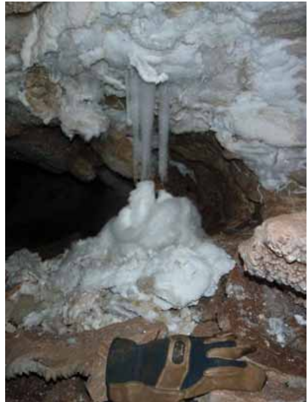
Gypsum speleothems discovered during a 3-day exploration camp trip in Jewel Cave, July 2008.

miles long, and remains the second-longest cave in the world.