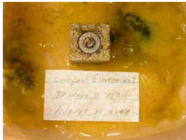
Figure 4. The compact fluorescent lamp grew the most on the limestone cube and supported a mat of biofilm on the bottom of the container.