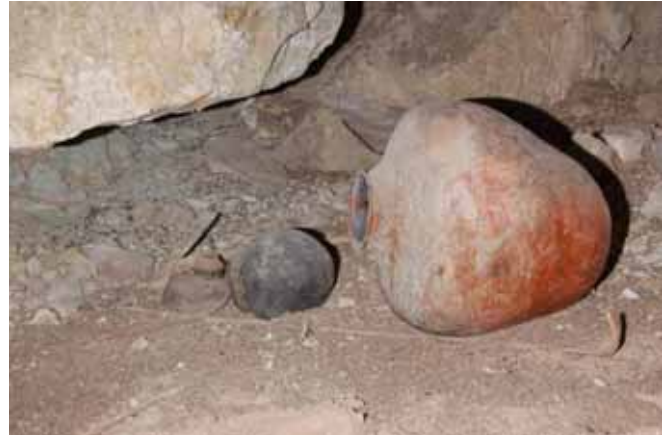
Three complete Native American ceramic pots found in Chamberpot Cave.

The second cave, Chamberpot Cave, is a small 250-foot long cave. In this cave, we discovered 6 complete ceramic pots (the largest is 20 x 21 inches), 2 painted bowls (black on white), 5 large partial ceramic vessels, one basket, and 3 sets of hunting tools. The tools are believed to be for hunting rabbits due to the rabbit snares and curved sticks in the “kits”. There were also numerous torches found in the cave and a set of arrows in the far reaches of the cave.