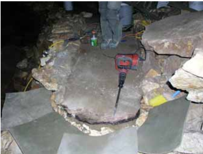
The on-going work of trail removal in the Talus Room of Lehman Cave. June 2008.

An interpretive component will reach and inform park visitors about the project and the need to protect natural and cultural cave resources.