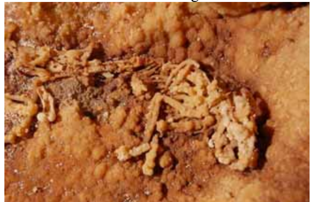
A skeleton covered with pool spar.

The cave also contains numerous skeletons and bones of unidentified mammals and at least one large bird. One of the skeletons is at the bottom of a dry pool and is covered in calcite pool spar (see photo below). Many leads remain to be surveyed and inventoried in this exciting new cave.