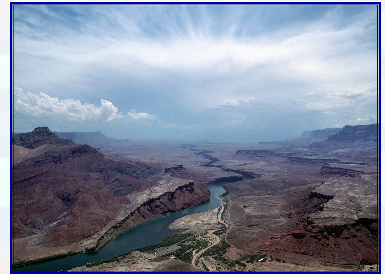
Colorado River at Lees Ferry