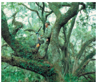
Blackbeard Island archery hunter

paths ideal for nature study. Saltwater creeks that pass through refuge marshland are open to fishing the entire year. Presently, two archery hunts for deer are scheduled on the island in the fall and winter (for exact dates and hunt regulations contact the Savannah NWR Visitor Center).