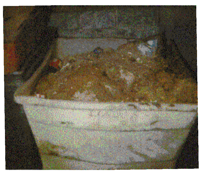
Tub of Unidentified Waste Found at Site

We have initiated audits of the new food safety procedures for inspecting meat and poultry plants, the Hazard Analysis Critical Control Point system, or HACCP. Since an increasing number of processing plants are becoming subject to HACCP, the safety and wholesomeness of the Nation's meat and poultry