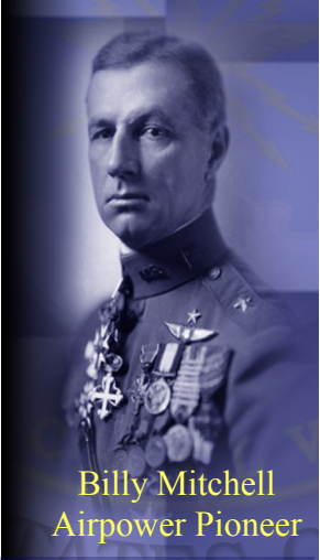
Billy Mitchell Airpower Pioneer