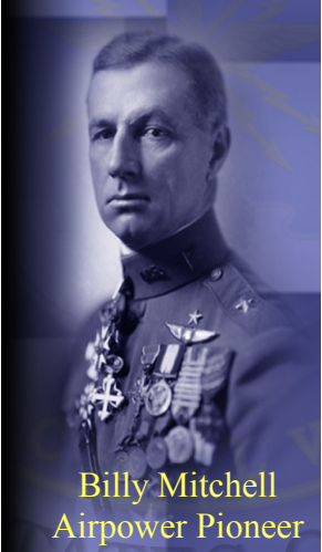
Billy Mitchell Airpower Pioneer