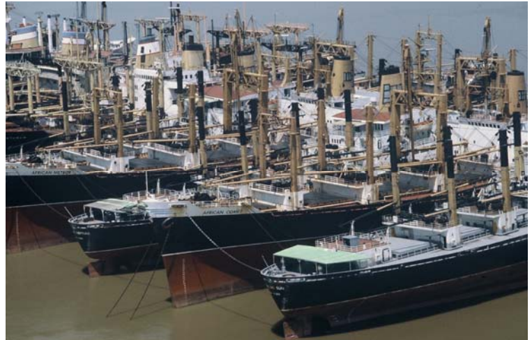
Top: SS Cape Alava underway. Right: SS African Comet at the James River Reserve Fleet circa 1980.