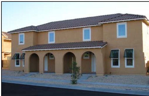
Privatized housing at Fort Irwin

ORNL is collaborating with the U.S. Army and several industry partners to showcase cool roofs that mitigate heat gain by high reflectance and new ventilation schemes through a study at Fort Irwin in Southern California. All costs for actual roof construction are borne by roofing manufacturers and the base housing budgets.