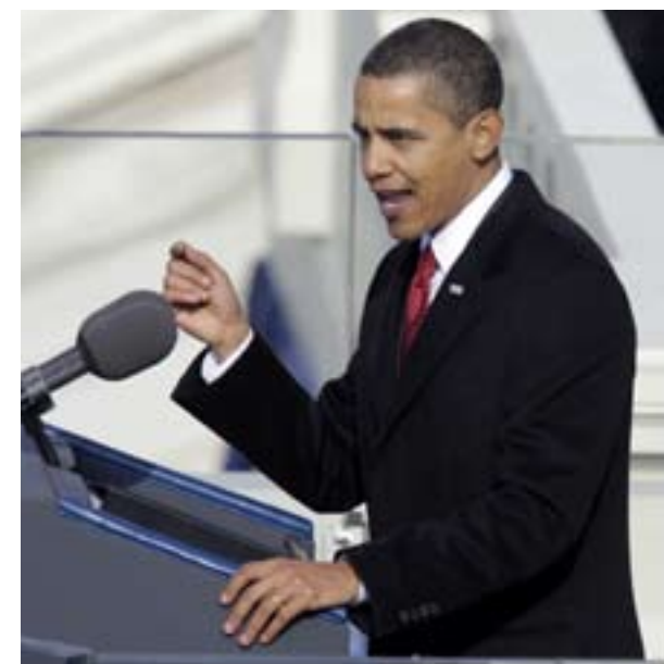
President Barack Obama delivers his inaugural address from the west front of the U.S. Capitol.

Tuesday, January 20, 2009 Washington, D.C.