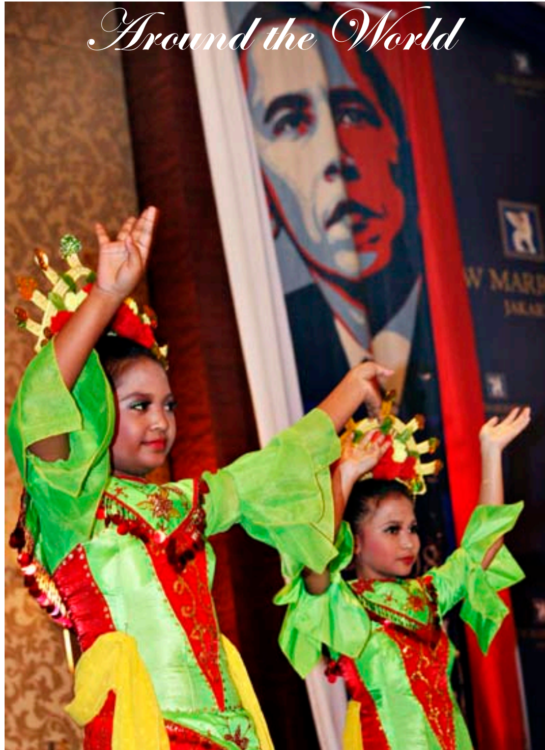
Children from the school Barack Obama attended while living in Indonesia dance during an inaugural party for him in Jakarta.