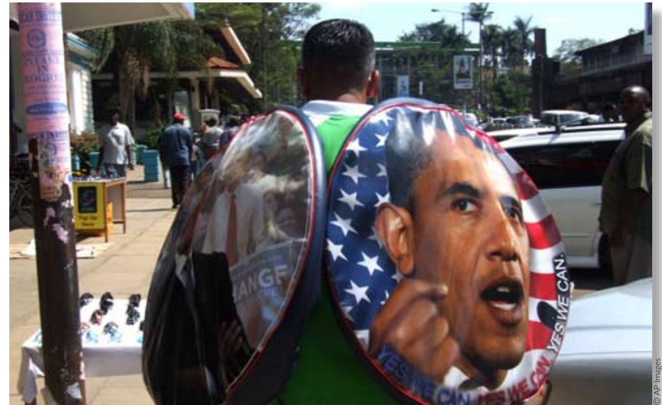
Below: A man sells tire covers carrying the portrait of Barack Obama in Kisumu, Kenya, in preparation for Obama's inauguration.

"And so to all other peoples and governments who are watching today, from the grandest capitals to the small village where my father was born: know that America is a friend of each nation and every man, woman, and child who seeks a future of peace and dignity, and we are ready to lead once more."