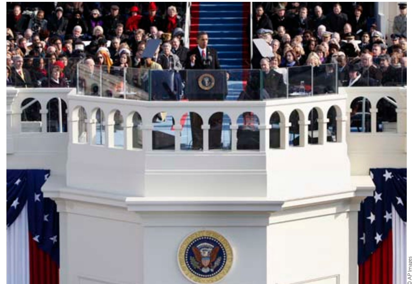
President Barack Obama delivers his inaugural address after having been sworn in on January 20, 2009.

Historic. Momentous. Unbelievable. Exciting. Poignant. Joyous.