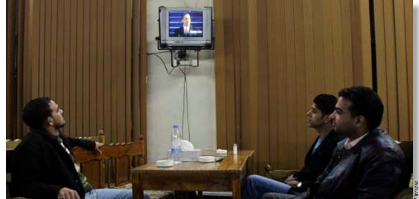
Above: These Iraqis are watching televised coverage of the inauguration of Barack Obama at a café in central Baghdad, Iraq, on January 20, 2009.