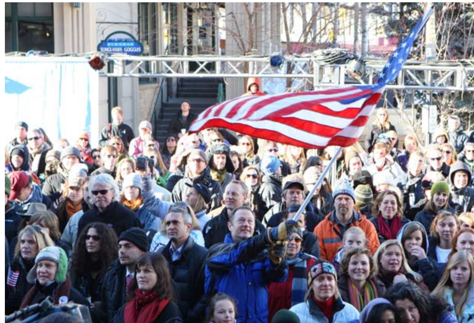
A crowd in Park City, Utah, joins the celebration of Barack Obama's presidential inauguration.