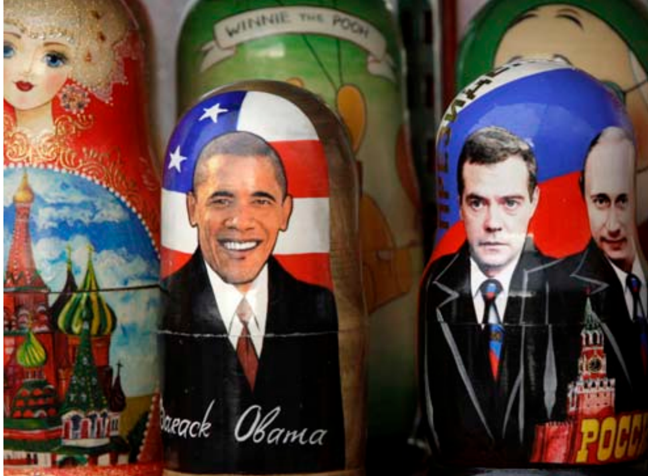
Above: These matryoshkas , traditional Russian nesting dolls made of wood, depict U.S. President Barack Obama and Russian President Dmitry Medvedev with Prime Minister Vladimir Putin.