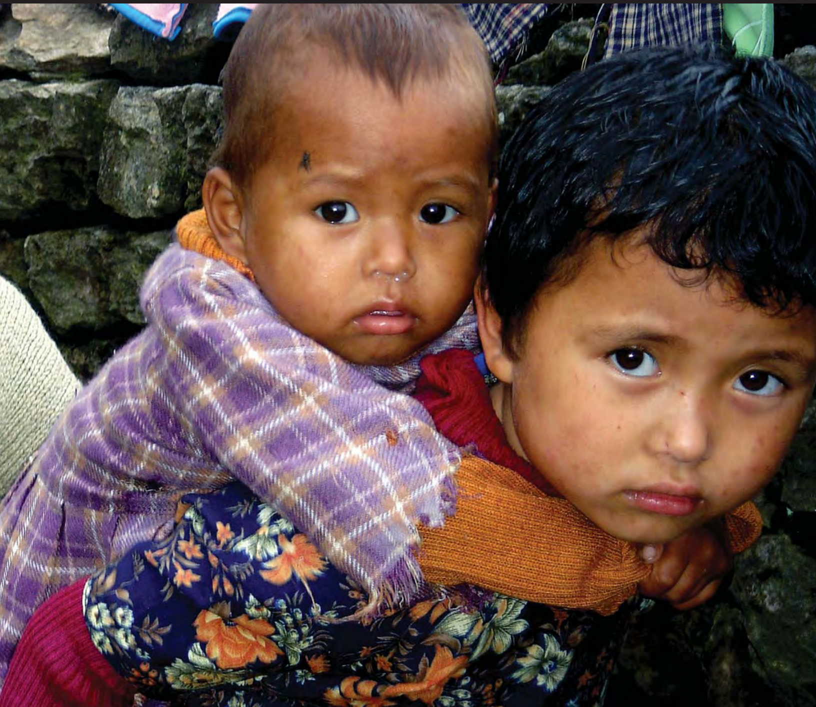
A young child takes care of her younger siblings in the hills of Uttarakhand state, India.