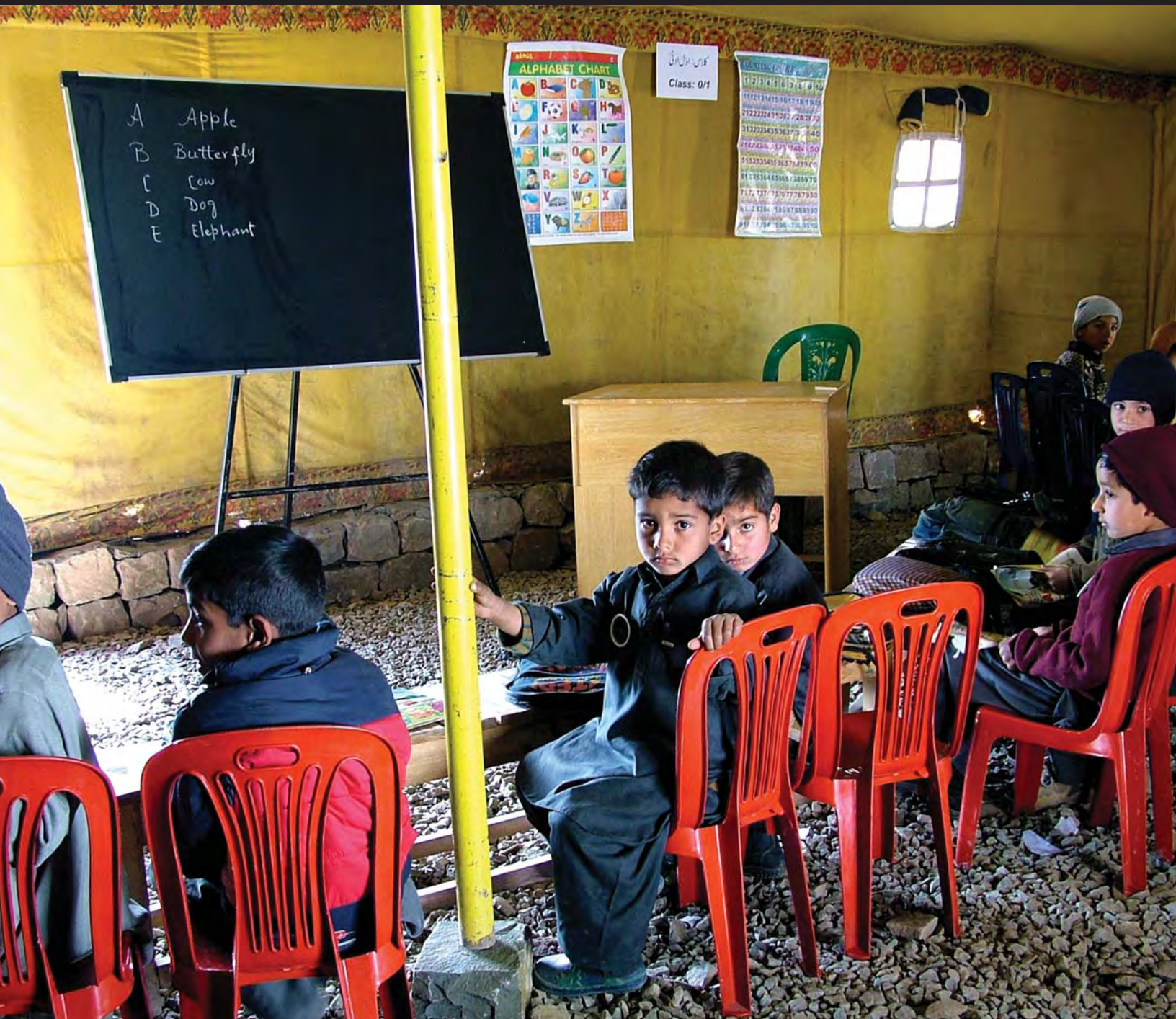
Second-graders in Pak Gali Boys School in Poonch District, Pakistan, were some of the first students to use new tent classrooms provided by USAID after the devastating October 2005 earthquake. Outfitted with desks and chairs, the classrooms helped schoolchildren re-establish normal routines after the quake.