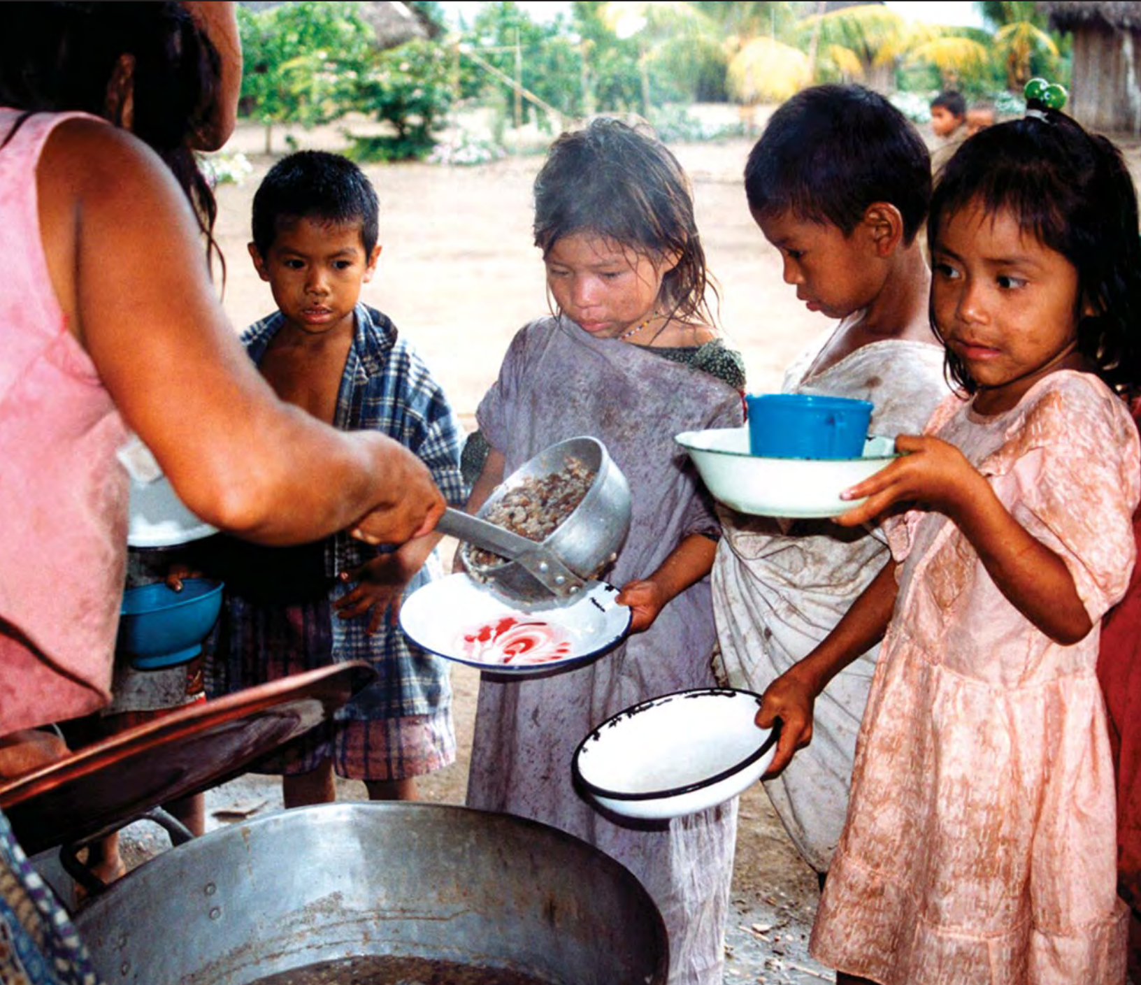
Indigenous Ashaninca children in the isolated jungle community of Oviri, along the Rio Tambo in Peru, receive food made by women in the village. Many children in the region have been orphaned as a result of political violence.