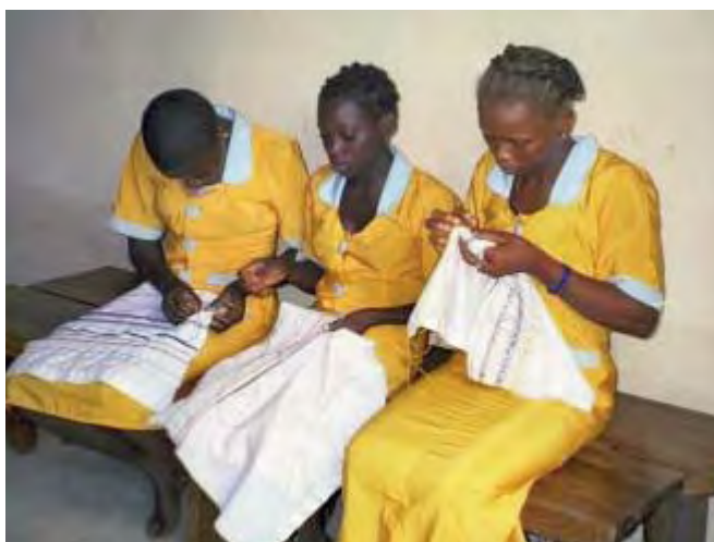
Girls saved from traffickers learn a trade at a rehabilitation center for trafficking victims sponsored by UNICEF, USAID, and the Government of Benin.

The U.S. President's Emergency Plan for AIDS Relief (PEPFAR) funds the largest service delivery program for highly vulnerable children affected by HIV/AIDS (referred to as orphans and vulnerable children or OVC). In the 15 focus countries, FY 2006 funds for care and support of orphans and vulnerable children were $152 million. When pediatric AIDS treatment ($63 million) is included, funds going to orphans