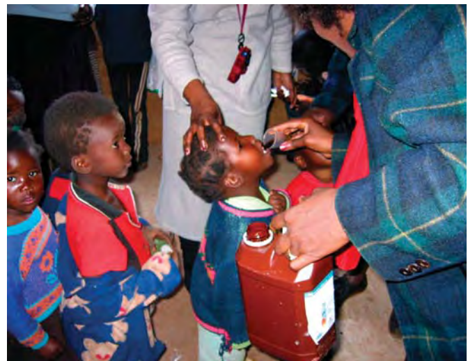
Vulnerable children in the low-income community of Gemiston, South Africa, many orphaned by AIDS, wait in line for medicine.

Initial meetings at the fast-track sites included representatives from CDC, DOD, DOL-funded projects, Peace Corps (in Uganda), DOS, UNICEF, UNHCR, ILO, USAID, and civil society, and represented programs in education, health, gender, social welfare, and child labor. Existing coordination for vulnerable children is led by PEPFAR with limited reach into programs addressing vulnerable children more broadly. Strong support exists for increased coordination, especially through strengthening government systems.