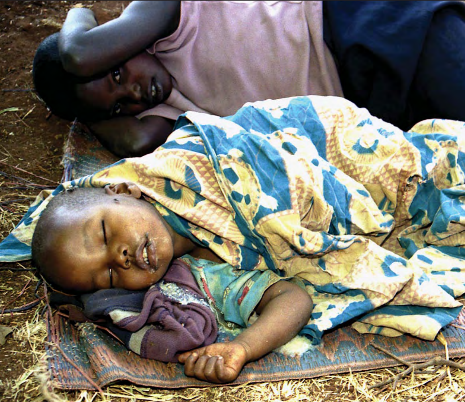
Child refugees, displaced by war in eastern Congo, take shelter at a UNHCR refugee camp in Burundi.