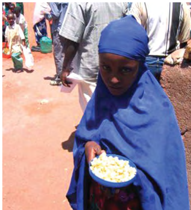
Schoolgirl receives food aid in Kenya.

During the next year, the Special Advisor will consult with relevant agencies to develop reporting information on each program that is available annually and which