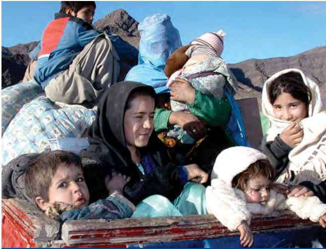
Six Afghan children arrive at a refugee camp in northwest Pakistan.

family care; or in some other way have suffered from a collapse of traditional social safety nets in their communities. The strategy adopts the term “highly vulnerable children” because the term “orphans and vulnerable children (OVC)” used in PL 109-95 is usually associated with children made vulnerable by HIV/AIDS. “Highly vulnerable children” refers to a broader range of children, made vulnerable by any of a variety of causes.