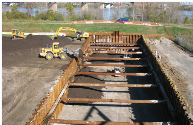
In FY09, the USACE initiated excavation west of the flood protection levee at City Property (DT-2).

The results of the review will be published in the "Five-Year Review Report for the St. Louis FUSRAP Sites." The report will also document any problems found and include recommendations to address them. The draft report is currently under regulator review. After regulator comments are addressed copies of the report will be placed with the Administrative Record located at the St. Louis Public Library, 1301 Olive Street, and at the FUSRAP Project Office at 8945 Latty Avenue in Berkeley.