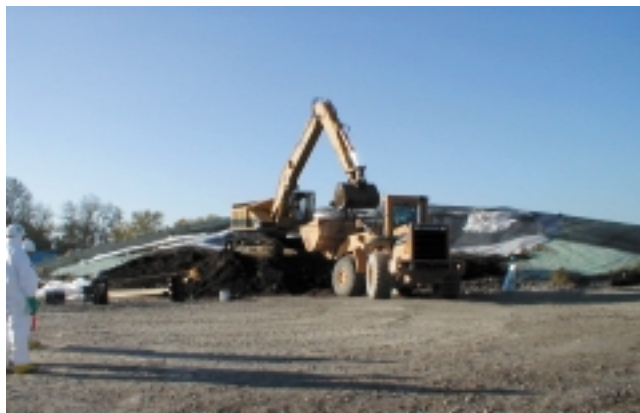
Twenty years after its initial creation, the removal of the Main Pile from HISS has begun. The pile contains approximately 25,000 cubic yards of soil.

SLAPS Vicinity Property owners will soon be receiving letters from the USACE regarding FUSRAP contamination on their property. Although owners are aware of the presence of the contamination on their property, the USACE is concerned that not everyone may understand how to request assistance with managing contamination on their properties.