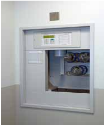
Example of typical pneumatic tube station