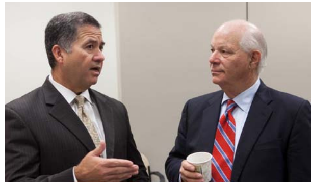
CBP Deputy Commissioner David Aguilar and Senator Benjamin Cardin (D-MD)

The BIEC strives to provide a high-level forum to resolve issues pertaining to interagency collaboration. Integrated