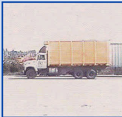
Before: Shot of Commercial Motor Vehicle (CMV) as it enters a roadside inspection facility.

The Infrared Inspection System (IRISystem) is a minivan equipped with an infrared camera on the roof and a display screen inside the vehicle. Enforcement personnel tested its effectiveness at roadside inspection facilities by screening for brake defects and producing results in a matter of seconds, known as "real time." As a commercial motor vehicle decelerates to enter a roadside inspection facility, an IRISystem operator scans the wheels with the camera. A thermal image of the wheels, showing their relative temperature, is displayed on the screen inside the van. Because the application of brakes creates heat, the wheels with functional (warm) brakes appear bright white in the infrared image, while the wheels with inoperative (cold) brakes appear dark. A color image enables the operator to easily identify a vehicle with functional or inoperative brakes.