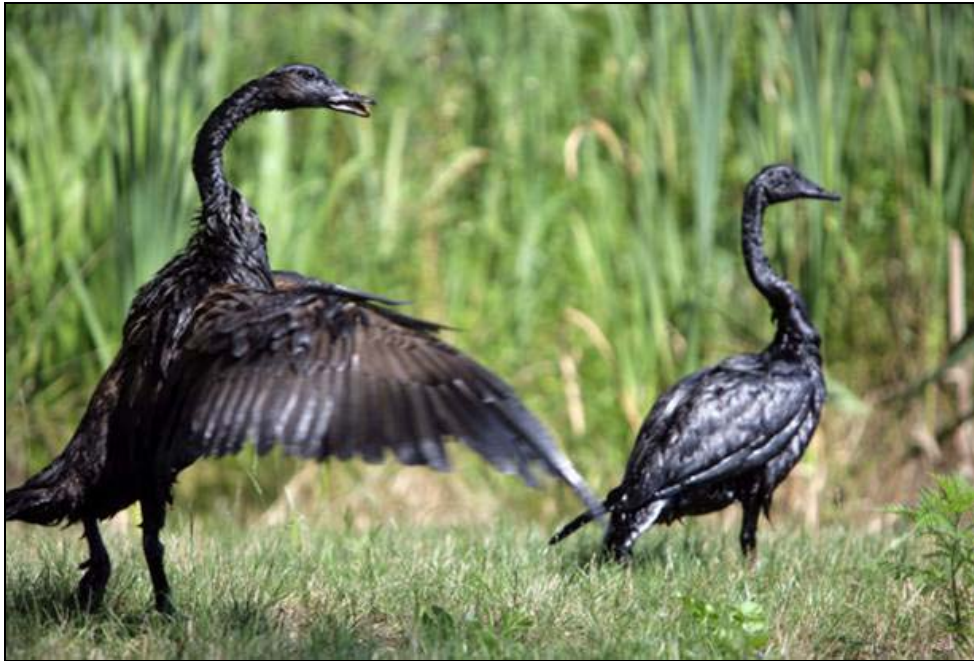
Oiled Canada geese at the Marshall River Pipeline Spill, MI