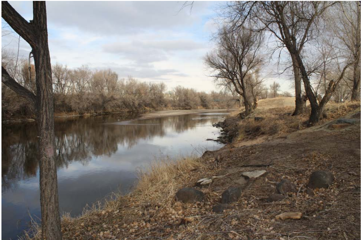
South Platte River, Denver, CO following riverbank slope re-contour and invasive Siberian elm removal

opportunities, and incorporate volunteer efforts to include the community in the restoration efforts at Overland Pond Park.