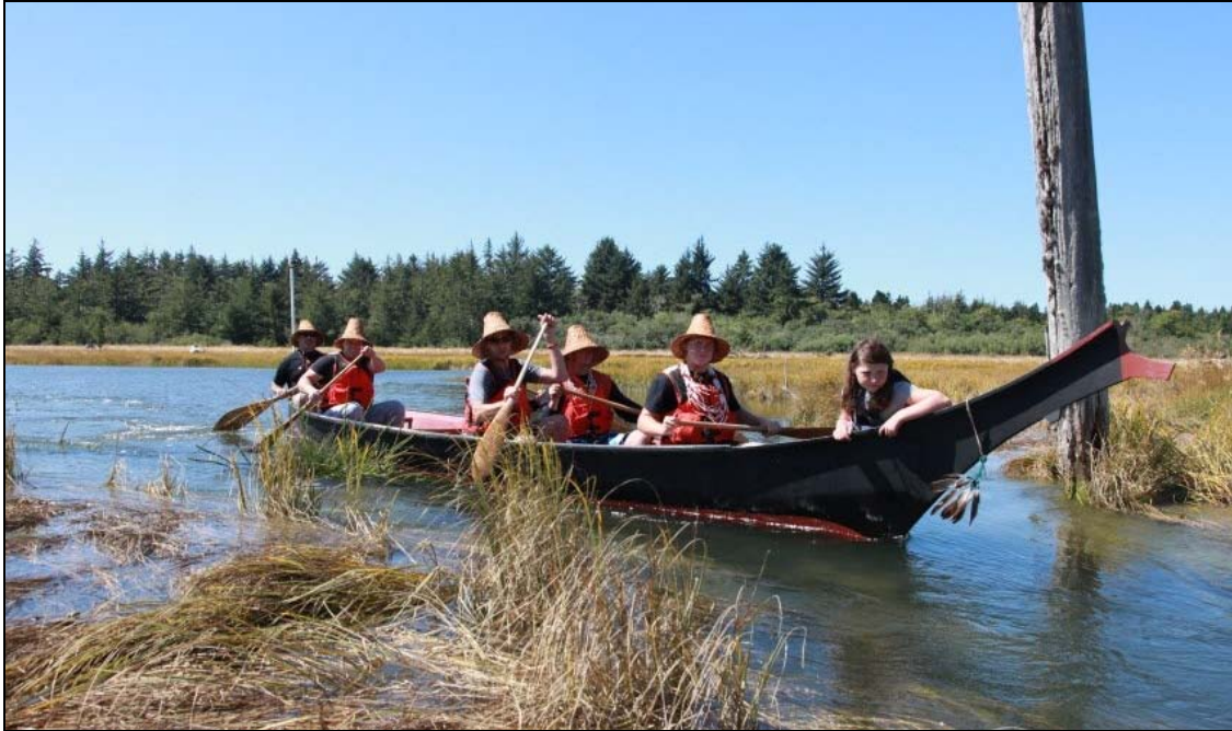
Members of the Coquille Indian Tribe paddle a ceremonial canoe into the freshly flooded Ni-les'tun Unit of Bandon Marsh NWR. Before the swath of land was diked and drained for farming about 100 years ago, it sustained the Coquilles for centuries.

Bandon Marsh's approximately $9.5 million restoration took more than a decade of planning, partnerships, property deals, scientific study, and engineering. The New Carissa Trustee Council (including the Department's Bureau of Land Management and Fish and Wildlife Service) partnered with more than two dozen public and private organizations to implement restoration projects within Bandon Marsh to address natural resource injury caused by the spill.