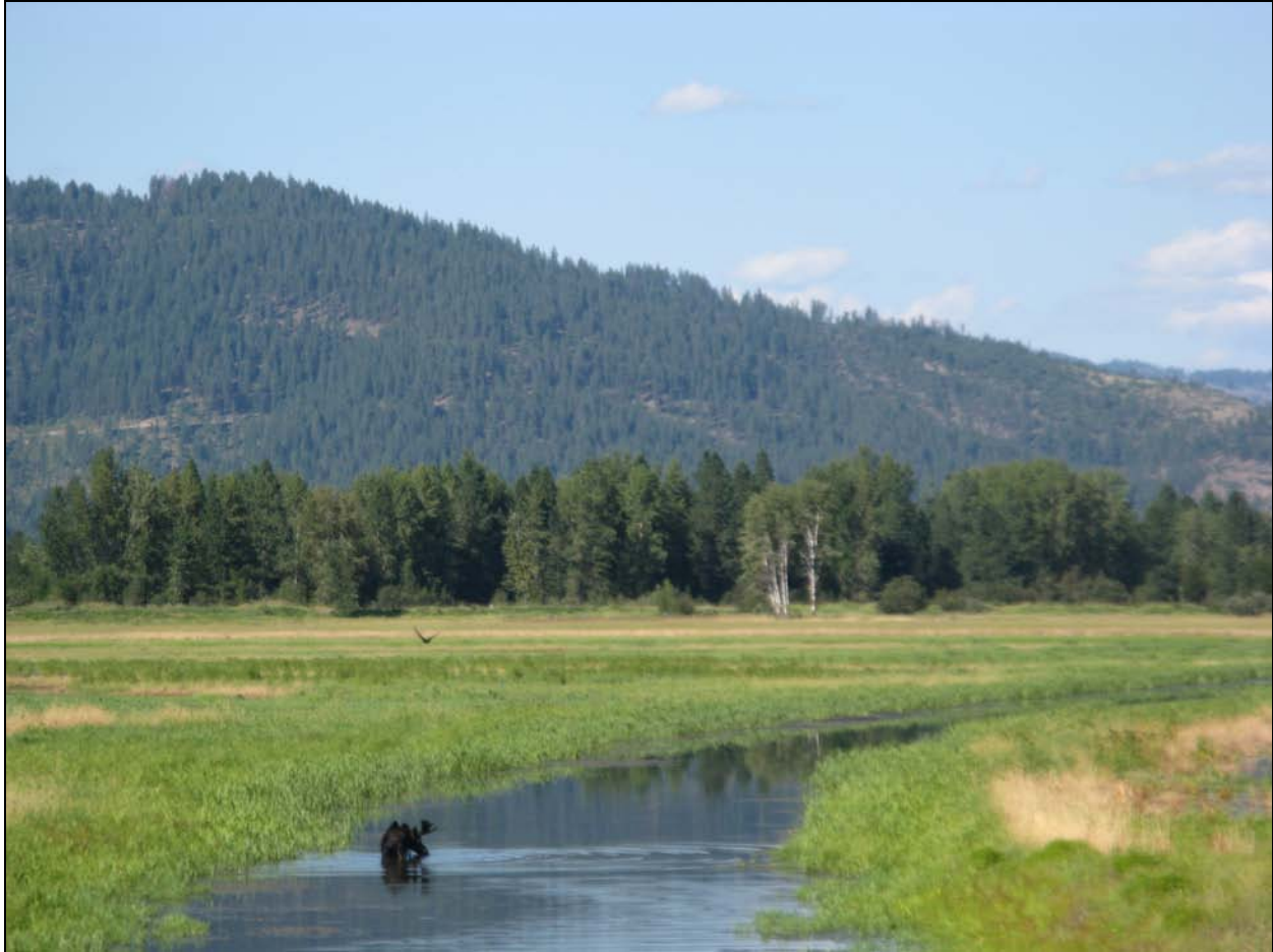
Restored wetland (Schlepp property), Coeur d'Alene Basin, ID

During the spring 2008 migration, FWS staff counted approximately 3,000 waterfowl in the area, and each year monitoring continues jointly with the EPA. FWS monitoring data show the remediated and restored habitat is attracting some of the highest and most diverse concentrations of waterfowl to the Coeur d'Alene Basin. Moreover, blood lead data suggests that waterfowl using the conservation easement area are experiencing reduced exposures to lead. This project is the first of its kind in the Basin, and is an important step in addressing Basin ecological contamination.