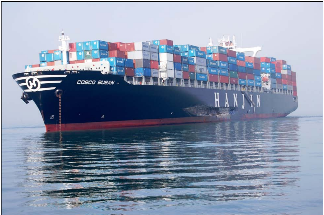
Damaged cargo vessel M/V Cosco Busan following November 2007 spill

In late January 2012, a U.S. District Court approved the largest settlement in the history of the Oil Pollution Act. The owners and operators of the M/V Cosco Busan , a container cargo vessel that struck the San Francisco-Oakland Bay Bridge in November 2007, will pay a total of $44.4 million to the United States, the State of California, the City and County of San Francisco and the City of Richmond for natural resource damages and penalties and to reimburse the governments for response costs. The spill of 53,000 gallons of bunker fuel oil killed nearly 7,000 birds and oiled over 100 miles of shoreline, including coastal and estuarine areas of the Golden Gate National Recreation Area, Point Reyes National Seashore, and the San Francisco Maritime National Historic Park. Of the total settlement, $23.6 million will be deposited into the DOI Restoration Fund for the joint use of Federal and State trustees to restore injured natural resources in the spill area, including bird and habitat restoration, fish and eelgrass restoration, and recreational use improvements, consistent with a publicly-reviewed restoration plan.