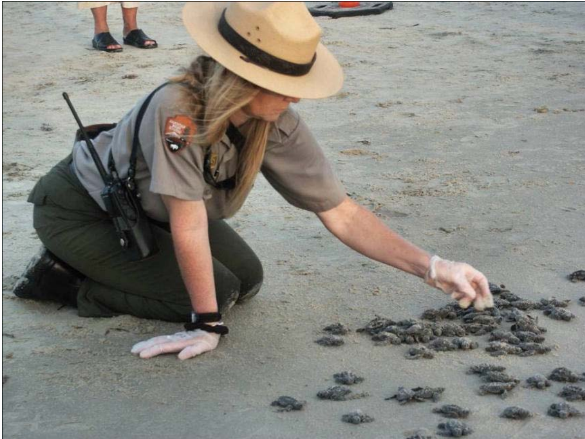
NPS employee from Padre Island National Seashore releasing recently-hatched Kemp's Ridley sea turtles.

Emergency restoration actions are those taken by the trustees prior to the completion of the natural damage assessment and restoration planning process to prevent or reduce continuing natural resource injuries, and avoid potential irreversible loss of natural resources. Actions implemented for this project included enhanced support of Kemp's Ridley nest detection and protection activities on the Texas Gulf Coast and construction of facilities to decrease response time and improve Kemp's Ridley nest detection and protection on Padre Island National Seashore.