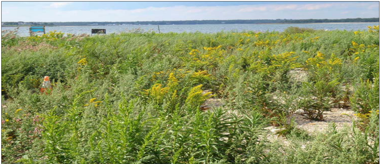
Restored tern nesting habitat on Ram Island (before, during, and after)