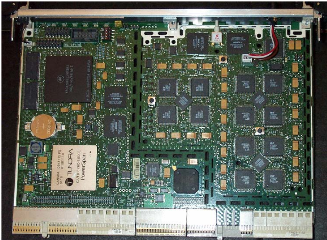
Figure 1: MGE SCCE front w/o tamper shield. Crypto boundary defined by dashed 'line'.