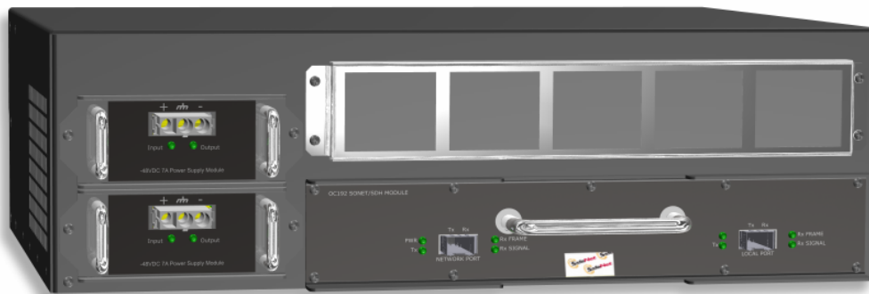
Figure 5. Model 650 Encryptor Rear View

The module has eight physical ports and four logical interfaces. The physical ports have the following functions: