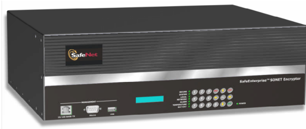
Figure 4. Model 650 Encryptor Front View.

The Model 650 encryptor has two network interfaces located in the back of the module: the Local Port interface connects to a physically secure private network and the Network Port interface connects to an unsecure public network. The rear panel also contains a tamper evident seal that indicates movement of the module cover with respect to the module enclosure.