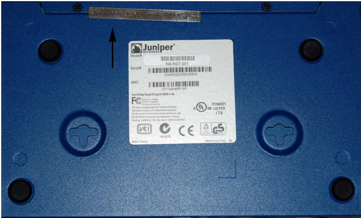
Figure 2: Underside of the NS-5GT, with location of tamper evident seal