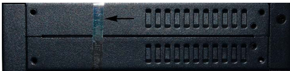
Figure 5: Side of both SSG 5 and 20 devices, with location of tamper evident seal