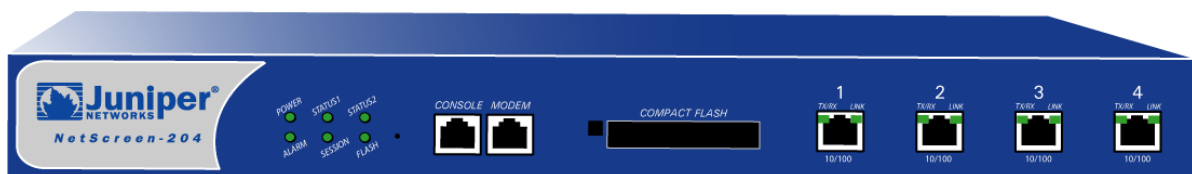
Figure 1: Front of the NetScreen-204 device