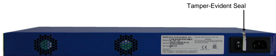
Figure 2: Tamper evident seal on power interface