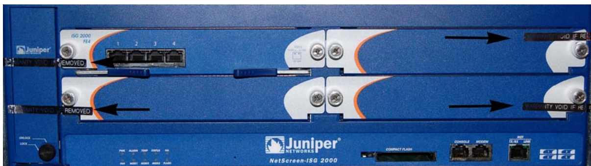
Fig. 3:Front of the ISG 2000, with location of tamper evident seals