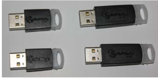
Figure 3 - All eToken Configurations

Note: The SafeNet eToken 5x05 includes an imprint label on the epoxy, which is applied during the manufacturing process. This label provides only manufacturing information and is not security relevant.