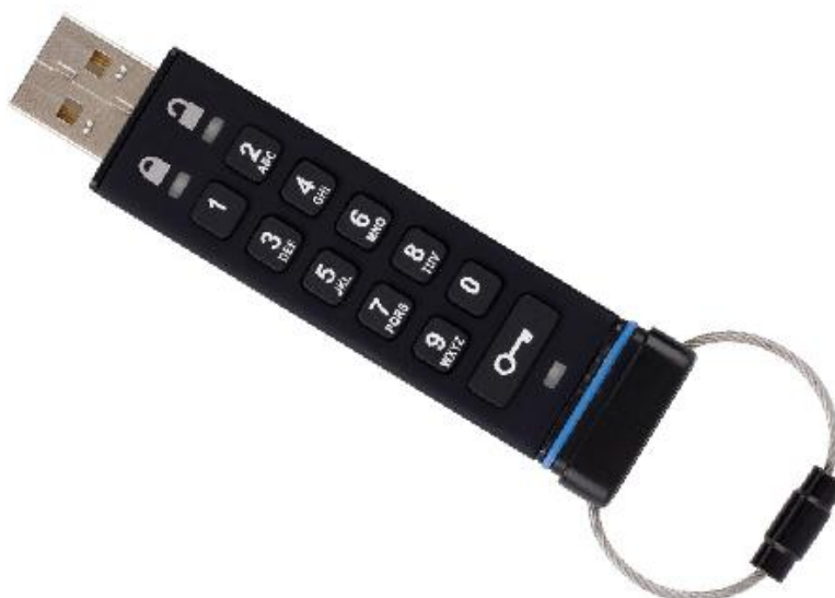
Figure 1 – Apricorn Aegis Secure Key cryptographic boundary showing input buttons and status LEDs