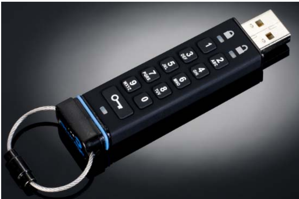
Figure 1 – iStorage datashur cryptographic boundary showing input buttons and status LEDs