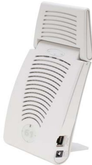
Figure 2 - AP-61 Series Wireless Access Points

The AP-60 access point supports diverse deployment options, delivering secure user-centric network services and applications for high-performance enterprise and campus environments, branch offices and retail spaces, as well as deployments over public and private networks as a Remote/Mobile AP. The AP-61 supports dual, integral, high-performance omni-directional multi-band antennas.