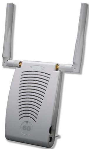
Figure 1 - AP-60 Series Wireless Access Point

The AP-60 access point supports diverse deployment options, delivering secure user-centric network services and applications for high-performance enterprise and campus environments, branch offices and retail spaces, as well as deployments over public and private networks as a Remote/Mobile AP. The AP-60 supports external antennas through dual, detachable antenna interface.