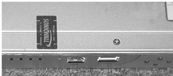
Figure 3: Tamper Seal #2 - Bottom Cover