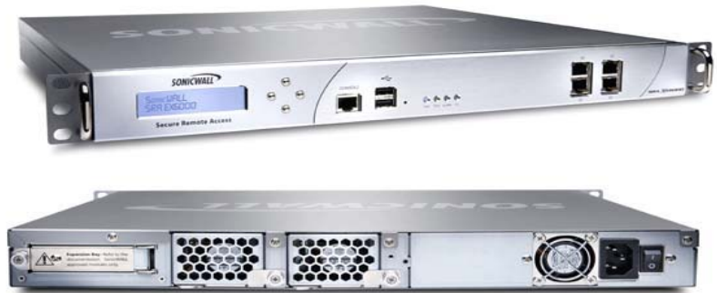
SonicWALL SRA EX6000