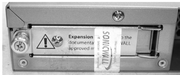
Figure 4: Tamper Seal #3 - Expansion Bay