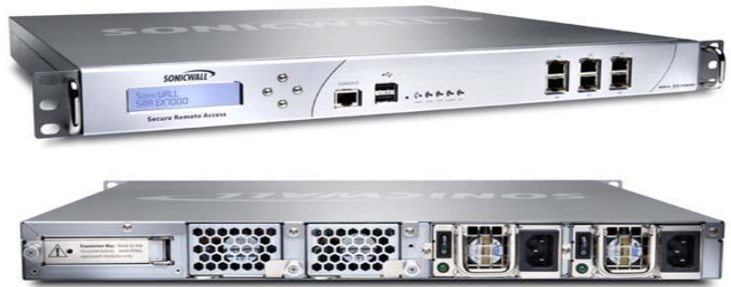
SonicWALL SRA EX7000