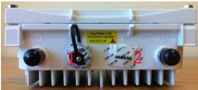
Figure 25 - Aruba AP-175 Tel placement front view

Following is the TEL placement for the AP-175: