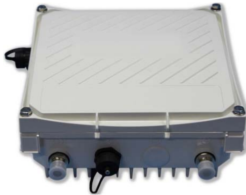
Figure 4 - AP-175 Wireless Access Point

The Aruba AP-175 is high-performance 802.11n (2x2:2) MIMO, dual-radio (concurrent 802.11a/n + b/g/n) indoor wireless access points capable of delivering combined wireless data rates of up to 600Mbps. This multi-function access point provides wireless LAN access, air monitoring, and wireless intrusion detection and prevention over the 2.4GHz and 5GHz RF spectrum. The multifunction AP-175 is an affordable, fully hardened outdoor 802.11n access point (AP) that provides maximum deployment flexibility in high-density campuses, storage yards, warehouses, container/transportation facilities, extreme industrial production areas and other harsh environments.