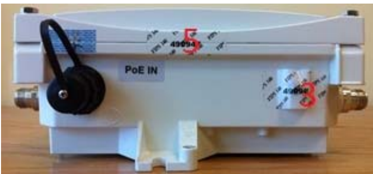
Figure 29 - Aruba AP-175 Tel placement top view