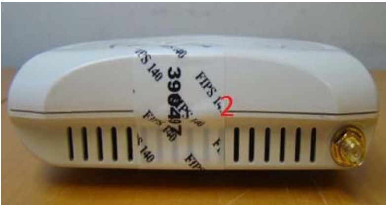
Figure 8 - Aruba AP-92 Tel placement top view