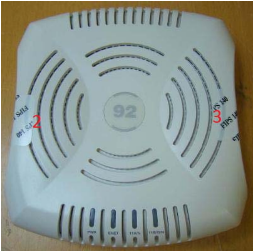
Figure 9 - Aruba AP-92 Tel placement bottom view