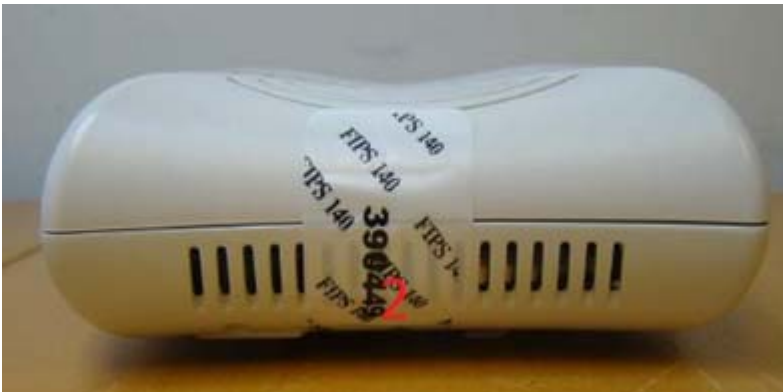
Figure 22 - Aruba AP-105 Tel placement right view