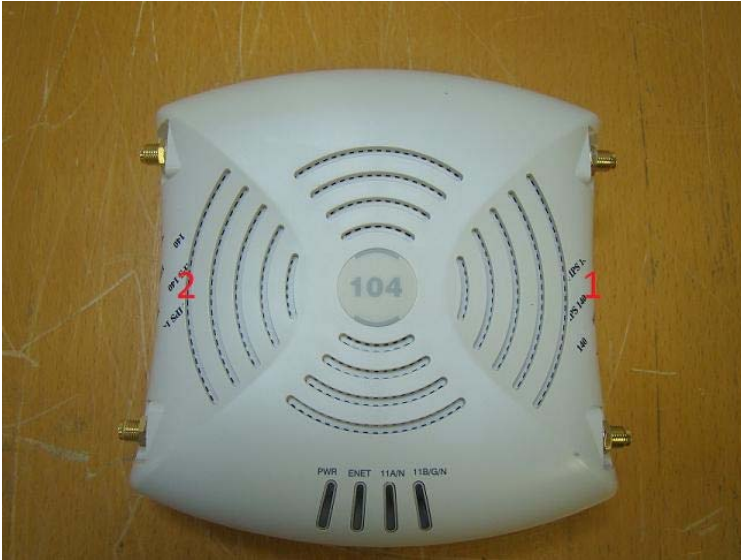
Figure 19 - Aruba AP-104 Tel placement bottom view