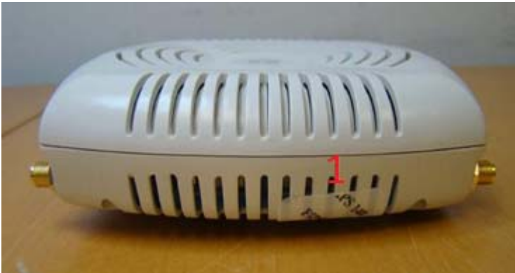
Figure 6 - Aruba AP-92 Tel placement left view