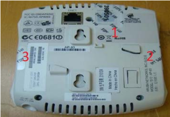
Figure 14 - Aruba AP-93 Tel placement top view