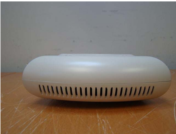
Figure 16 - Aruba AP-104 Tel placement left view