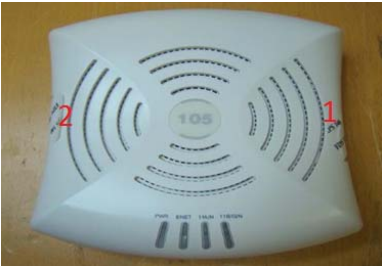
Figure 24 - Aruba AP-105 Tel placement bottom view