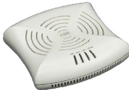
Figure 3 - AP-105 Wireless Access Point

The Aruba AP-105 is high-performance 802.11n (2x2:2) MIMO, dual-radio (concurrent 802.11a/n + b/g/n) indoor wireless access points capable of delivering combined wireless data rates of up to 600Mbps. This multi-function access point provides wireless LAN access, air monitoring, and wireless intrusion detection and prevention over the 2.4GHz and 5GHz RF spectrum. The access point works in conjunction with Aruba Mobility Controllers to deliver high-speed, secure user-centric network services in education, enterprise, finance, government, healthcare, and retail applications.