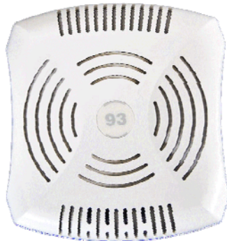
Figure 2 - AP-93 Wireless Access Point

The Aruba AP-93 is robust-performance 802.11n (2x2:2) MIMO, single radio supporting 2.4 GHz or 5 GHz (802.11a/ b/g/n), indoor wireless access points capable of delivering wireless data rates of up to 300Mbps. This multi-function access point provides wireless LAN access, air monitoring, and wireless intrusion detection and prevention. The access point works in conjunction with Aruba Mobility Controllers to deliver high-speed, secure user-centric network services in education, enterprise, finance, government, healthcare, and retail applications.