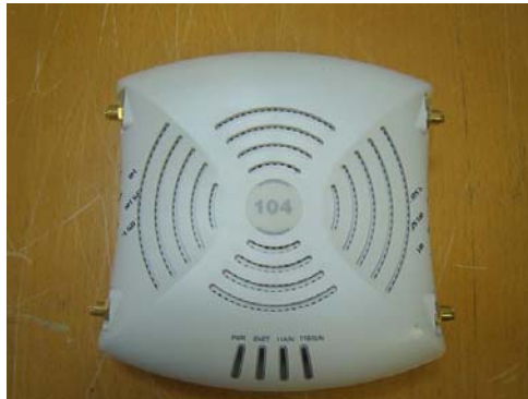
Figure 3 - AP-104 Wireless Access Point

The Aruba AP-104 is high-performance 802.11n (2x2:2) MIMO, dual-radio (concurrent 802.11a/n + b/g/n) indoor wireless access points capable of delivering combined wireless data rates of up to 600Mbps. This multi-function access point provides wireless LAN access, air monitoring, and wireless intrusion detection and prevention over the 2.4GHz and 5GHz RF spectrum. The access point works in conjunction with Aruba Mobility Controllers to deliver high-speed, secure user-centric network services in education, enterprise, finance, government, healthcare, and retail applications.