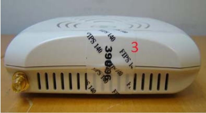
Figure7 - Aruba AP-92 Tel placement right view