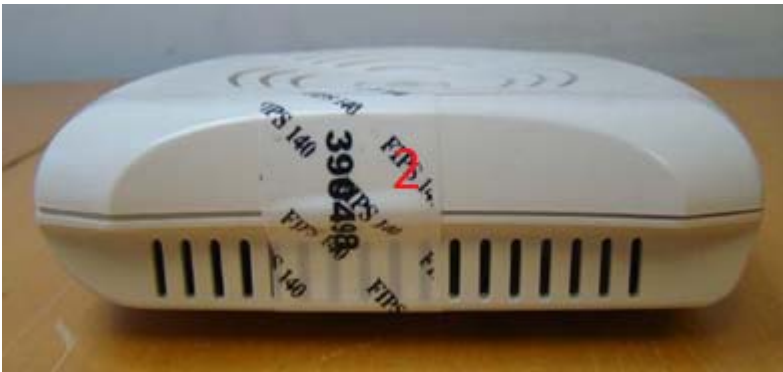
Figure 12 - Aruba AP-93 Tel placement right view