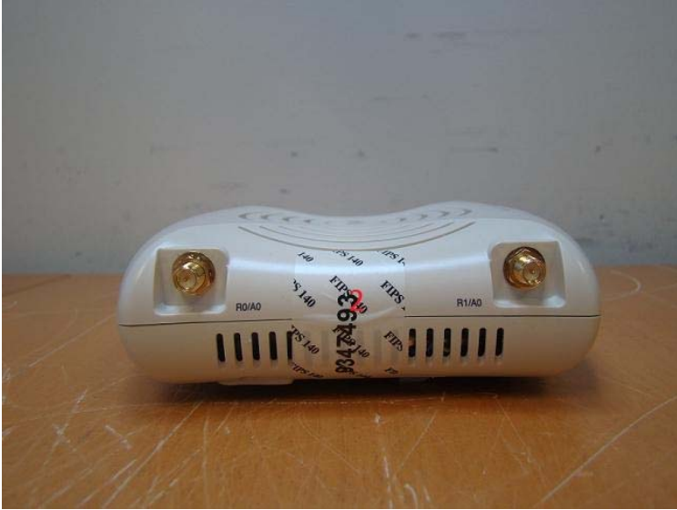
Figure 17 - Aruba AP-104 Tel placement right view