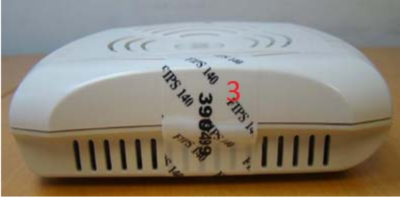
Figure 13 - Aruba AP-93 Tel placement bottom view