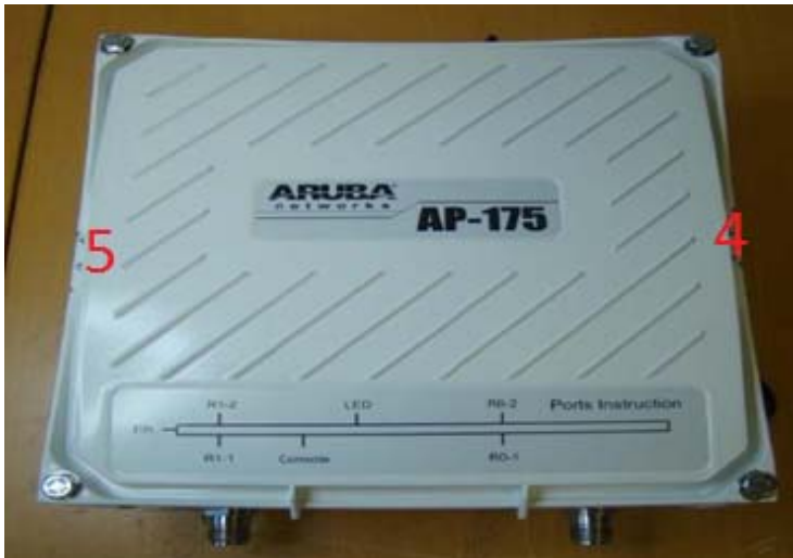
Figure 30 - Aruba AP-175 Tel placement bottom view