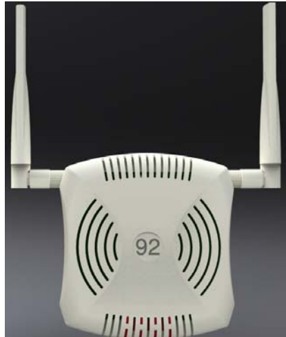
Figure 1 - AP-92 Wireless Access Point

The Aruba AP-92 is robust-performance 802.11n (2x2:2) MIMO, single radio supporting 2.4 GHz or 5 GHz (802.11a/ b/g/n), indoor wireless access points capable of delivering wireless data rates of up to 300Mbps. This multi-function access point provides wireless LAN access, air monitoring, and wireless intrusion detection and prevention. The access point works in conjunction with Aruba Mobility Controllers to deliver high-speed, secure user-centric network services in education, enterprise, finance, government, healthcare, and retail applications.