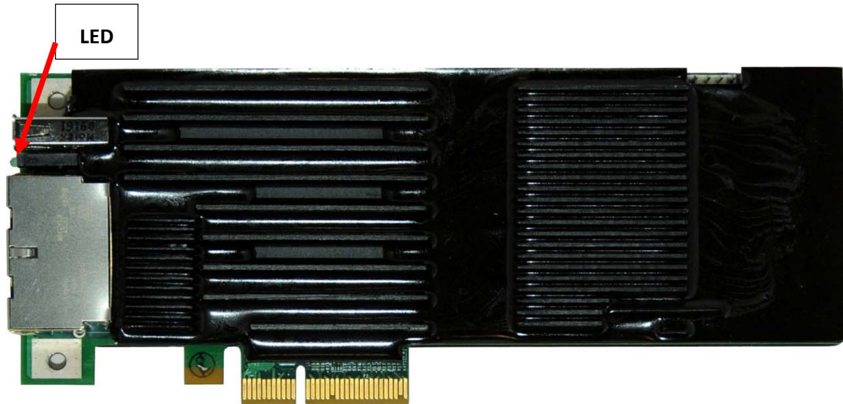
Figure 1 – Top View of Cryptographic Module

The module is a hardware/firmware multi-chip embedded cryptographic module. The module provides cryptographic primitives to accelerate approved and allowed algorithms for TLS 1.0 and SSH. The cryptographic functionality includes modular exponentiation, random number generation, and hash processing, along with protocol specific complex instructions to support TLS 1.0 security protocols using the embedded NITROX chips. The module implements single and two factor authentication at FIPS 140-2 Level 3 security. The physical boundary of the module is implemented by an epoxy enclosure.