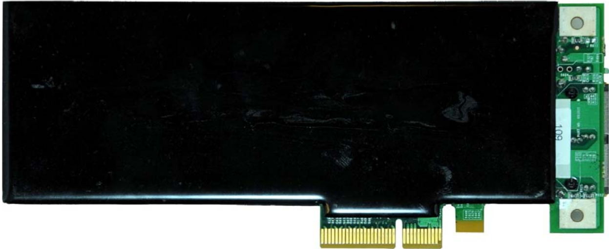
Figure 2 – Bottom view of Cryptographic Module

The configuration of hardware and firmware for this validation is: