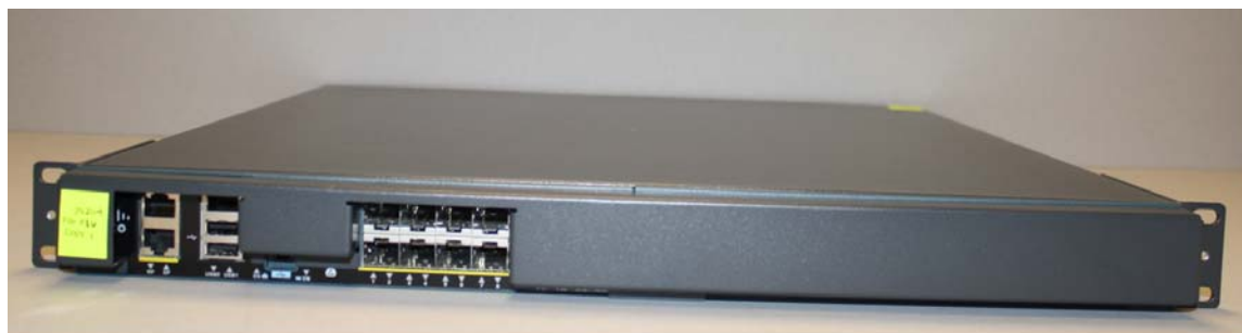
Figure 1 Entire Module

The module automatically detects, authorizes and configures access points, setting them up to comply with the centralized security policies of the wireless LAN. In a wireless network operating in this mode, WPA2 protects all wireless communications between the wireless client and other trusted networked devices on the wired network with AES-CCMP encryption. CAPWAP protects all control and bridging traffic between trusted network access points and the module with DTLS encryption.