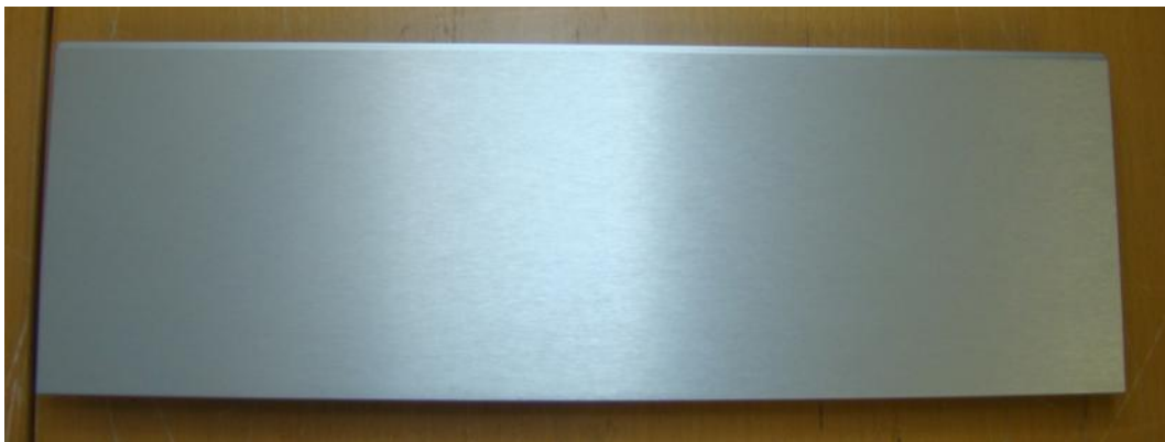
Figure 5 - Top