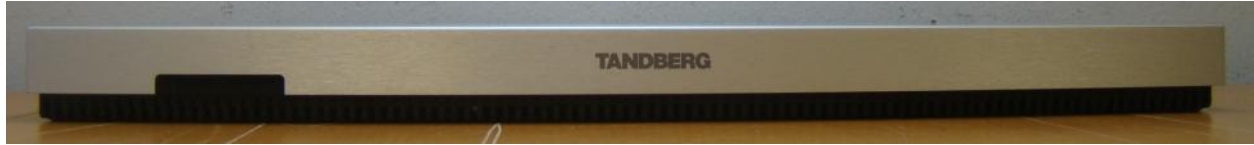
Figure 1 – Front