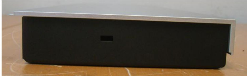
Figure 2 - Left