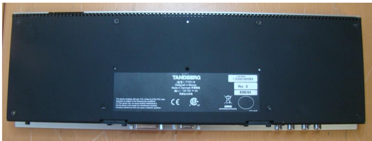
Figure 6 - Bottom