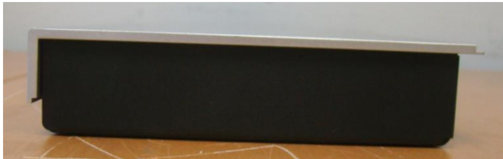
Figure 3 - Right