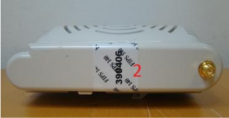
Figure 5: AP-124 Top view