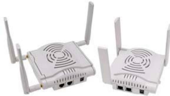
Figure 1 – Aruba AP-120 Series Wireless Access Points

The Aruba AP-124 and AP -125 are high-performance 802.11n (3x3) MIMO, dual-radio (concurrent 802.11a/n + b/g/n) indoor wireless access points capable of delivering combined wireless data rates of up to 600Mbps. These multi-function access points provide wireless LAN access, air monitoring, and wireless intrusion detection and prevention over the 2.4-2.5GHz and 5GHz RF spectrum. The access points work in conjunction with Aruba Mobility Controllers to deliver high-speed, secure user-centric network services in education, enterprise, finance, government, healthcare, and retail applications.