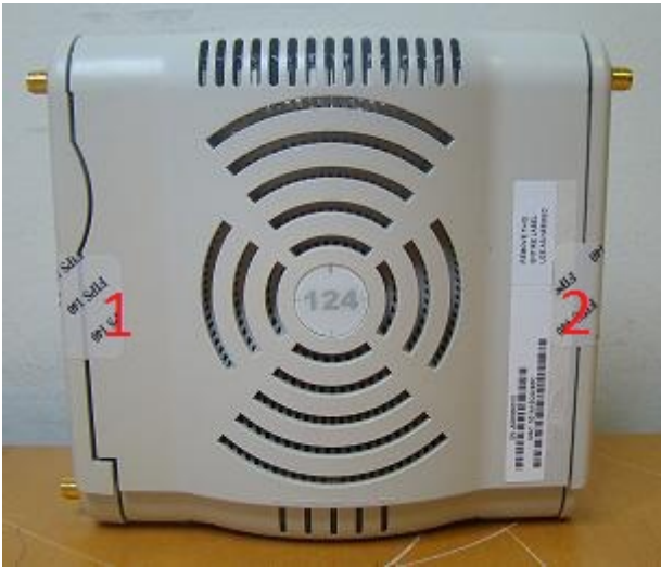
Figure 6: AP-124 Bottom view