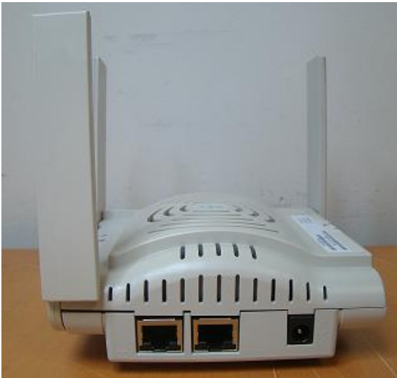
Figure 8: AP-125 Back view