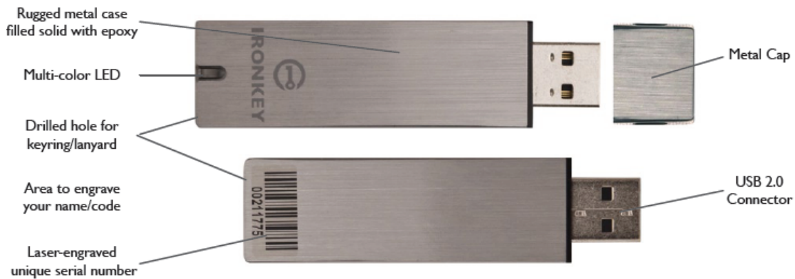
Figure 1 – Image of the Cryptographic Module (S250)

The cryptographic boundary is defined as being the outer perimeter of the metallic enclosure and is depicted below.