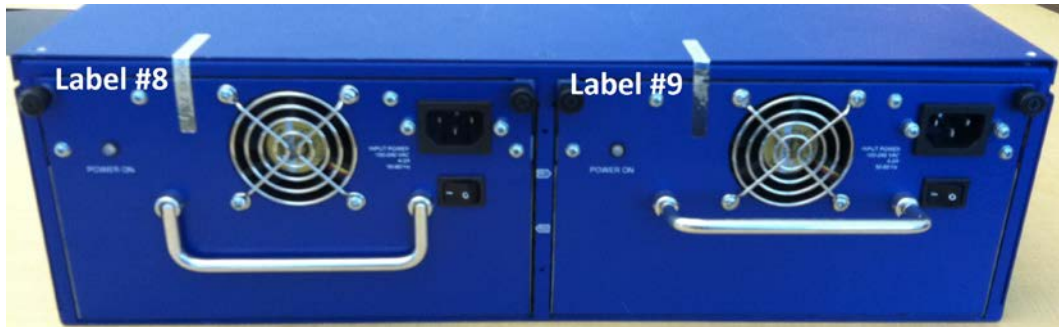
Fig. 11: Rear of the ISG 2000