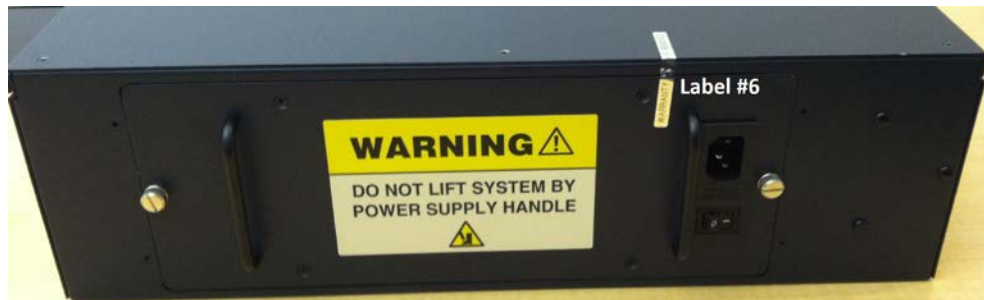
Fig. 4: Rear of ISG 1000