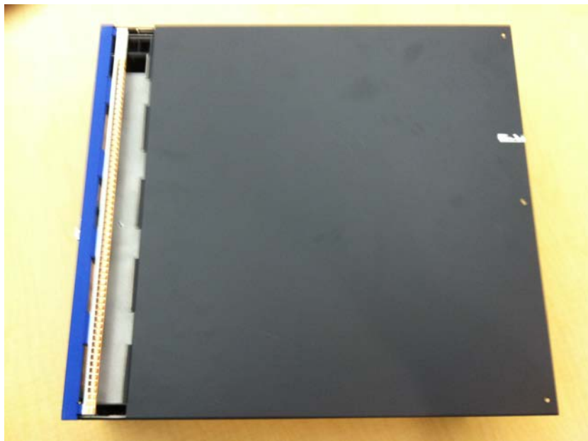
Fig. 7: ISG 1000 with cover partially removed