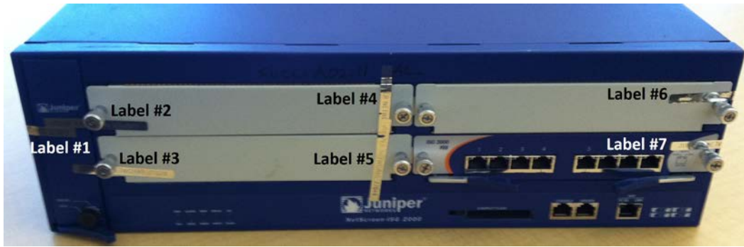
Fig. 8: Front of the ISG 2000