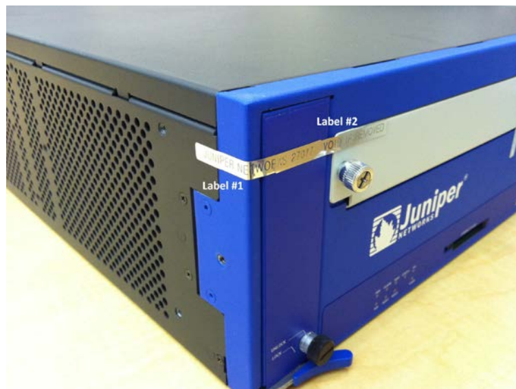
Fig. 5: Left edge of ISG 1000