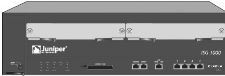
Fig. 1: NetScreen-ISG 1000