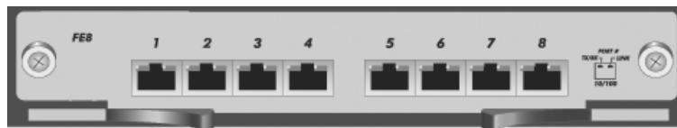
Fig. 2A: NS-ISG-FE8 I/O Module - 8-port 10/100 Fast Ethernet