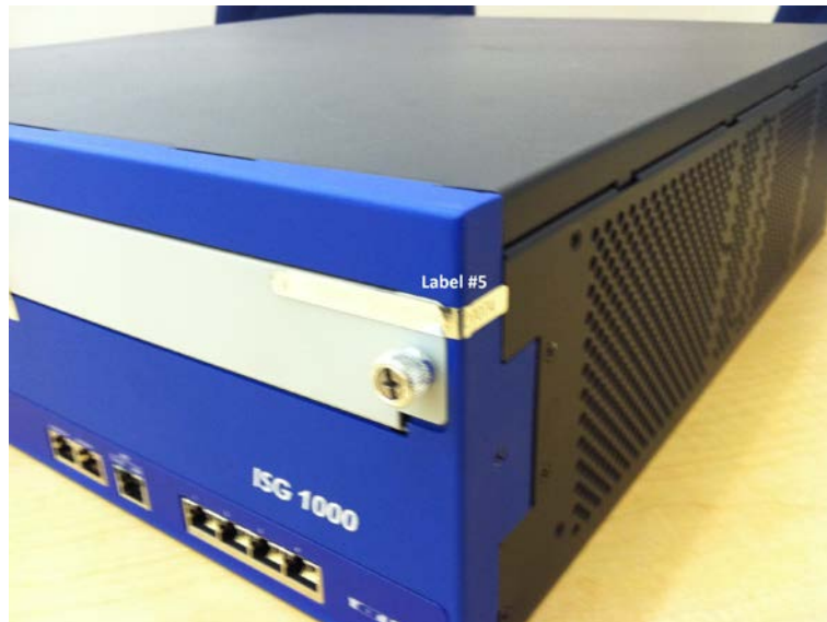
Fig. 6: Right edge of ISG 1000