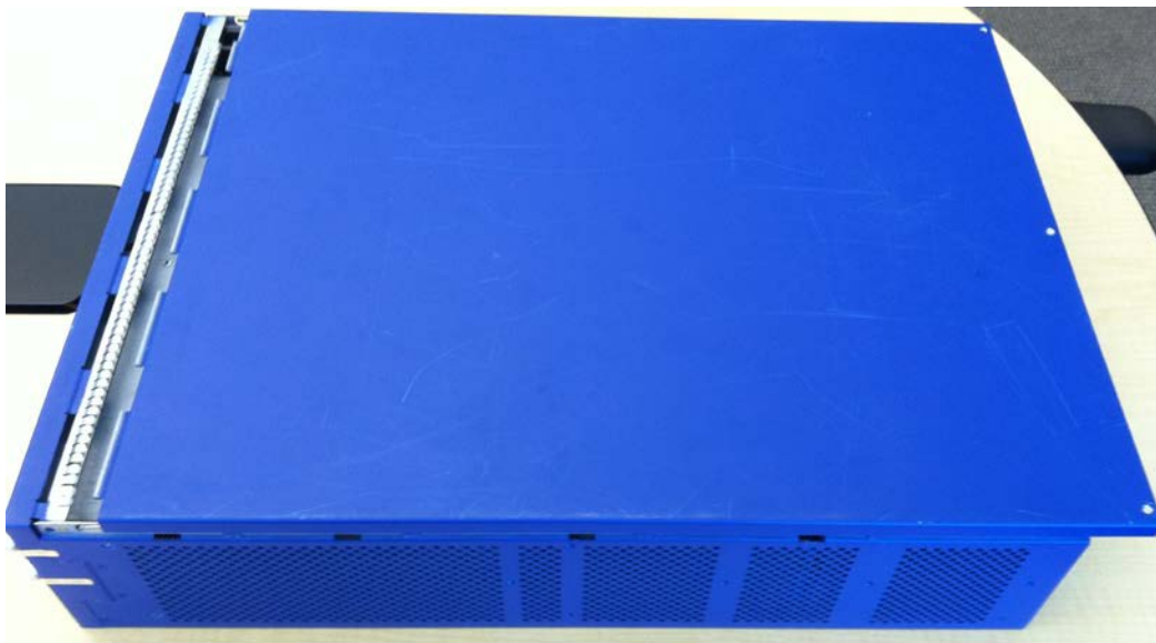
Fig. 12: ISG 2000 with cover partially removed