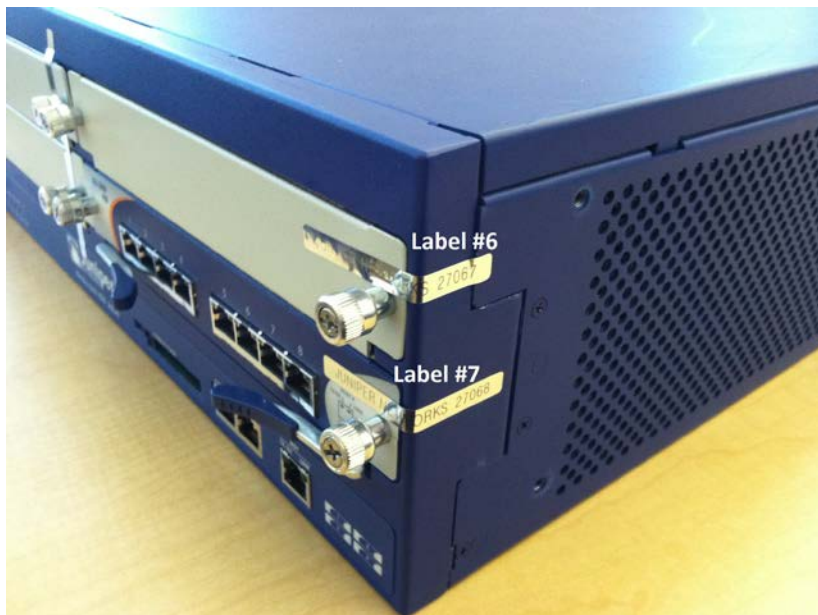
Fig. 9: Right edge of the ISG 2000