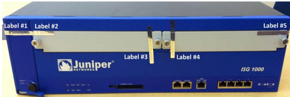
Fig. 3: Front of the ISG 1000