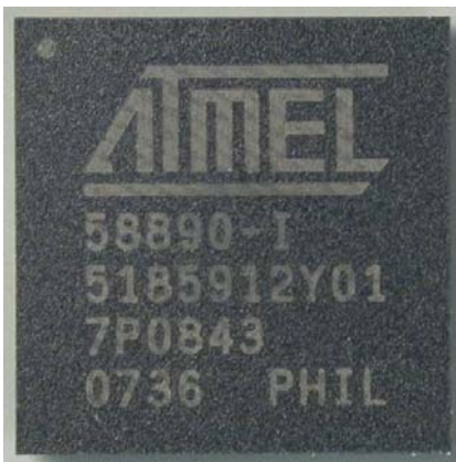
Figure 1: MACE Chip (Top)

The figures below are applicable to Cryptographic Module hardware kit number 5185912Y01 and 5185912Y03. Cryptographic Module hardware kit number 5185912Y01 and 5185912Y03 have identical physical security characteristics.