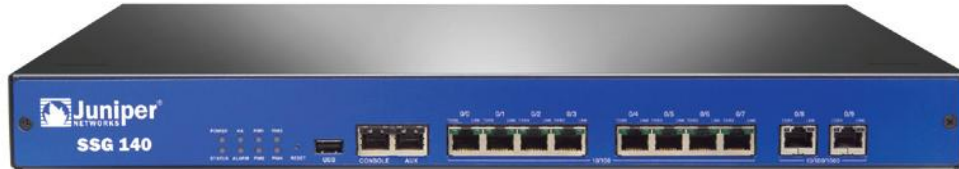
Figure 2: Front of the SSG 140 device