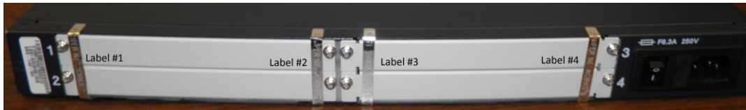
Figure 3: Rear of the SSG 140 device