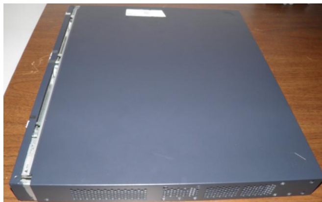
Figure 6: SSG 140 with cover slid back