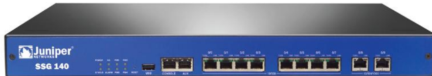
Fig. 1: SSG 140

The entire case is defined as the cryptographic boundary of the module. The SSG 140 physical configuration is defined as a multi-chip standalone module. The chips are production-grade quality and include standard passivation techniques. The SSG 140 conforms to FCC part 15, class B.