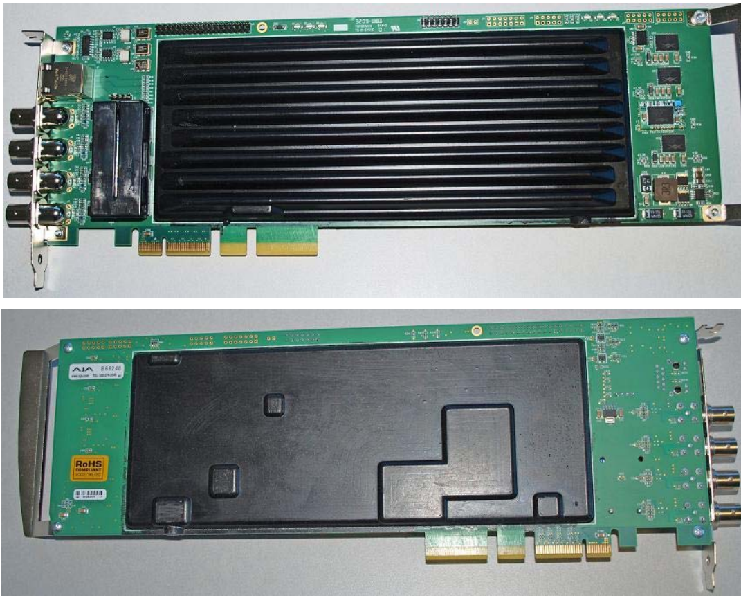
Figure 2 – Image of the Z-OEM-DCI-Q-R2 (Top & Bottom)