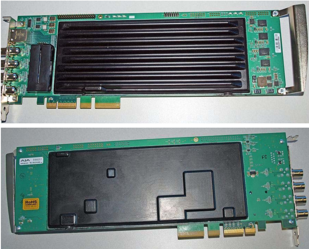
Figure 3 – Image of the Z-OEM-DCI-Q-R3 (Top & Bottom)