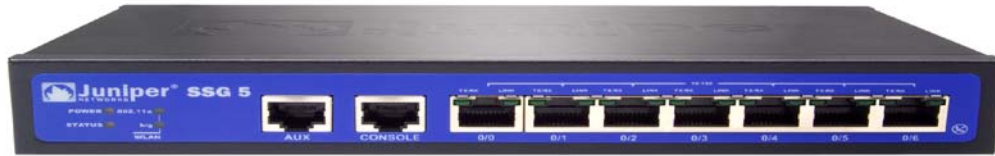
Figure 3: Front of the SSG 5 device