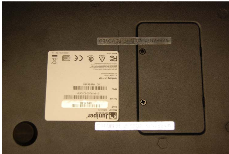
Figure 8: Underside of both SSG 5 and 20 devices, with location of tamper evident seals

Tamper evident seals (8 in total) should be applied to: