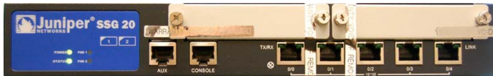
Figure 5: Front of the SSG-20 device