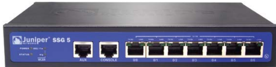
Fig. 1: SSG 5

The entire case is defined as the cryptographic boundary of the module. The SSG 5/20 series physical configuration is defined as a multi-chip standalone module. The chips are production-grade quality and include standard passivation techniques. The SSG 5/20 series conforms to FCC part 15, class B.