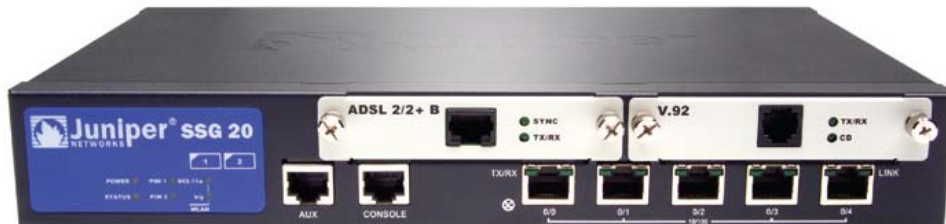
Fig. 2: SSG 20