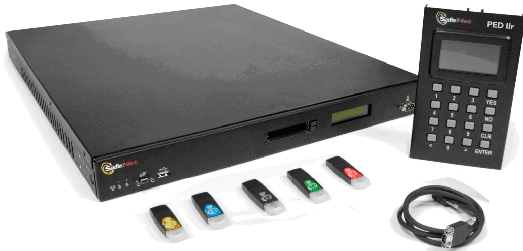
Figure 2-2. Luna SA with PED and iKeys