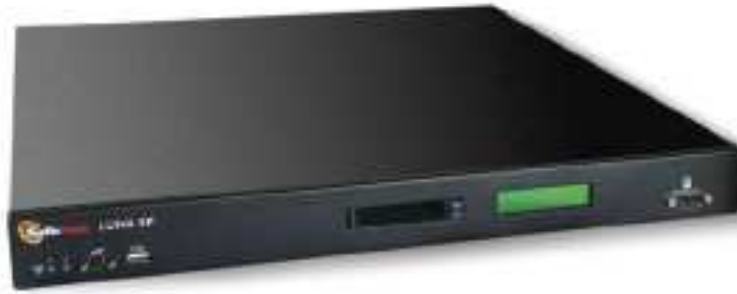
Figure 2-3. Luna SP with Luna PCI Module Installed