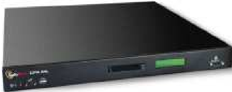
Figure 2-4. Luna XML with Luna PCI Module Installed