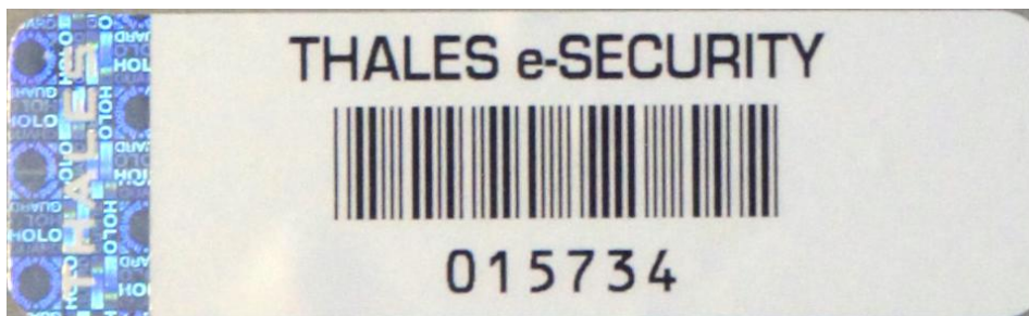
Figure 3: Close-up of Thales tamper-evident label

Figure 3 shows the enlarged image of the Thales tamper-evident label. Note that the labels have rounded corners – i.e. the grey corners of this picture are not a part of the label. As shown, the left-hand end of the label has a holographic background image. If there is an attempt to peel the label from the metal cover, the surface will discolour; and, in the darkening colour, the word “VOID” will appear and will remain visible even if the label is pressed back to the surface of the cover. Any significant damage to either label directly above the protected screw heads may indicate attempts at tampering with the module.