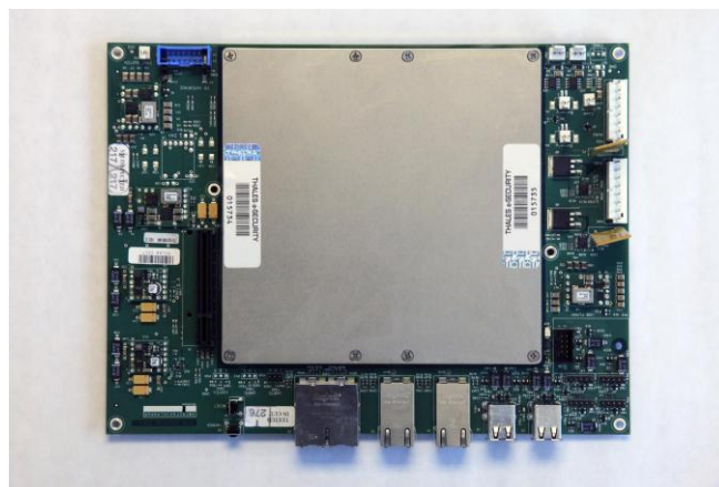
Figure 1: TSPP-B

TSPP contains a protected non-volatile memory that can be used by applications to contain confidential key material.