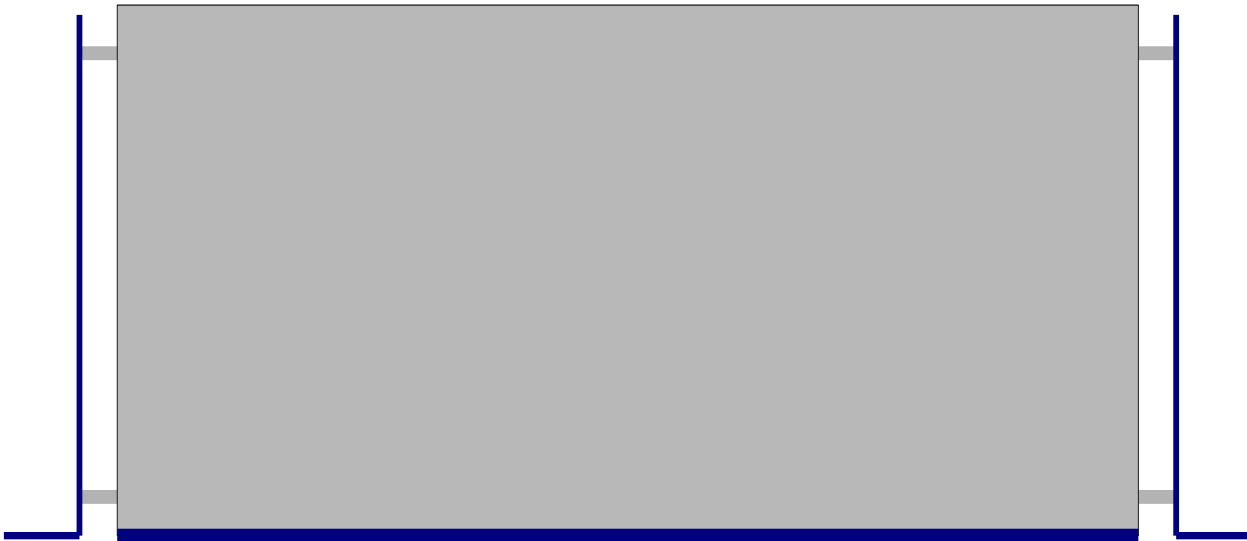
Figure 4-4 1600x439 Bottom

The tamper evident labels shall only be applied at the Thales facility. Tamper evident labels are not available for order or replacement from Thales.