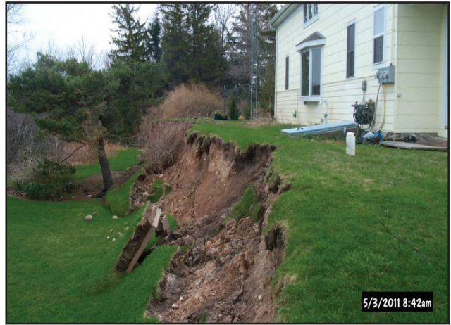
Bluff erosion threatens property and homes in the Great Lakes.

to discuss the project, obtain their feedback and ideas, and identify data and information. Being able to have a local partner that was trusted by the counties, knew the issues, and had worked on hazards projects in the past with these communities helped ensure that the planning guide was grounded in practical application and reality.