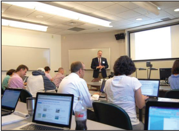
Local workshop attendees test the planning guide.