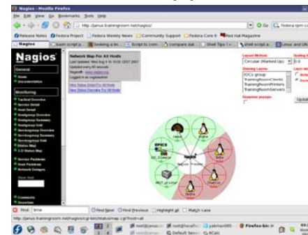
FIG. 3: LivEPICS with NAGIOS 2D Map

The iocBaseApplication (the utility that creates the directory structure necessary to develop an application) can be launched immediately after the boot. The OPI tool included in the CD is MEDM (Motif Editor and Display Manager), the alarm manager is AH (Alarm Handler) while the IOC database configuration tool is VDCT[3] (provided by Cosylab). The Channel Access Probe is available to test the status of a record on the network. Asyn and MSI packages allow to create device support applications and medium-sized EPICS DataBases. The CD includes the following documents: Application Developer Guide, IOC Application Building, Record Reference Manual, Channel Access Manual, Channel Access Protocol, State Notation Language Manual.