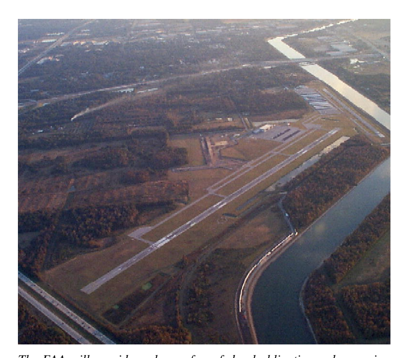
The FAA will consider releases from federal obligations, changes in use, and changes in designation according to the types of release requests in connection with the various federal obligations. In some cases, FAA's approval of a change in use is not a release of a specific federal obligation. Rather, it may represent FAA's concurrence with a sponsor's proposed change in use to eliminate any potential impact on a general federal obligation to provide aeronautical access and to operate and maintain infrastructure. For example, the FAA should not release property on the approach end of a runway if this results in a structure or construction that would impact the airport. As shown here, the highway on the lower left corner of the photograph has resulted in an extensive displaced threshold, diminishing the utility of the airport.

If aeronautical land is to remain for use its primary aeronautical purpose but also be used for a compatible revenueproducing nonaeronautical purpose, no formal release request is required. This is considered a concurrent use of aeronautical and property requires FAA approval. Aeronautical property may be used for a compatible nonaviation purpose while at the same time serving the primary purpose for which it was acquired. For example,