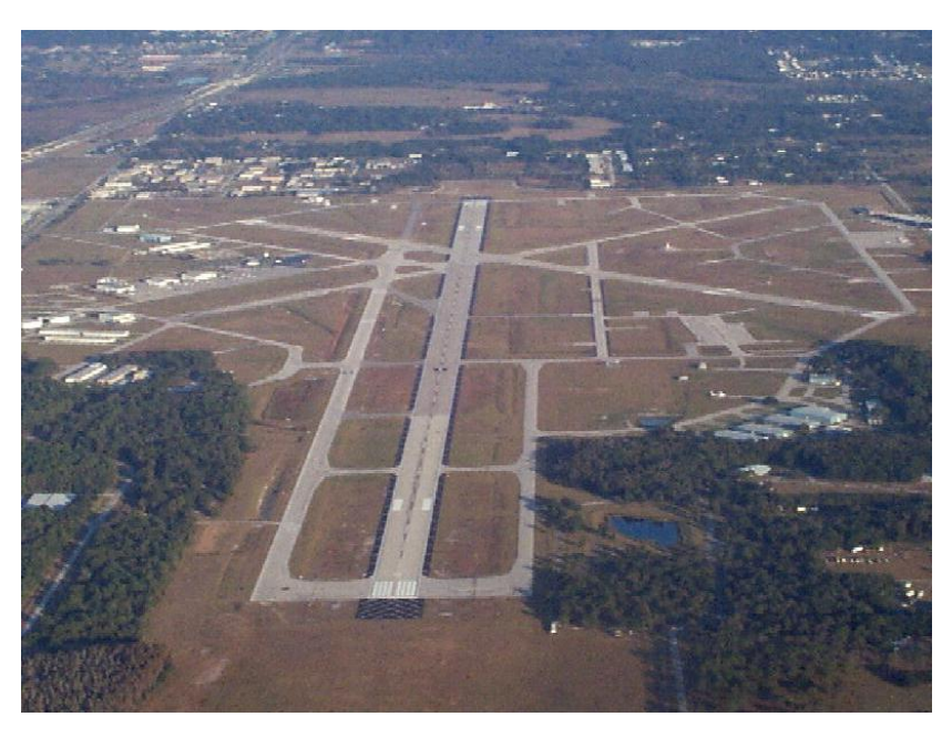
The FAA Administrator's authority to grant a release depends on the type of obligating document, such as a property conveyance or grant agreement. It also depends on the type of grant agreement, such as airport planning, noise mitigation, or airport improvement. Furthermore, the timing and circumstance of the particular document affects the Administrator's ability to grant a release. In all cases, the benefit to civil aviation is the FAA's prime concern.

Any property, when described as part of an airport in an agreement with the United States or defined by an airport layout plan (ALP) or listed in the Exhibit "A" property map, is considered to be "dedicated" or obligated