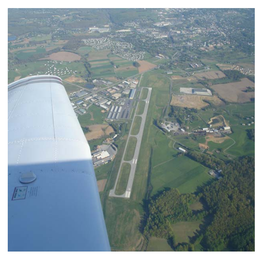
For a request to release an entire airport that is to be replaced by another new or existing airport, the general policy is to treat the proposal as a trade-in of the land and facilities developed with federal aid at the old airport toward the acquisition and development of better facilities at the new airport.

(2). Noise Land for Compatibility Purposes. A sponsor entering into a grant after December 30. under the AAIA, as amended by the 1987 Airport Act, will dispose of noise land at fair market value when the land is no longer needed for noise compatibility purposes. This also applies to land purchased under FAAP/ADAP/AIP. An interest or right shall be reserved in the land to ensure it will be used only for purposes that are compatible with the noise levels generated by aircraft. The portion of the disposal proceeds that represent the federal government's share is to be reinvested in another approved noise compatibility project, reinvested in an approved airport development project deposited into the Trust Fund. Disposal of noise land