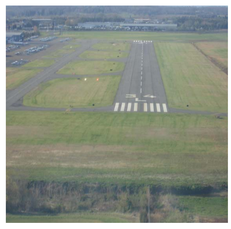
Consistent with the FAA mission, the most important objective in FAA's oversight of the compliance program is to ensure and preserve safety at federally obligated airports. Safety includes, among other things, maintaining runways, taxiways, and other operational areas in a safe and usable condition; keeping runway approaches cleared; providing operable and well-maintained marking and lighting in order to ensure safe aircraft operations.

When enforcement action is taken, it must be fair and applied in a uniform manner. When safety issues are identified, however, expeditious action is expected.