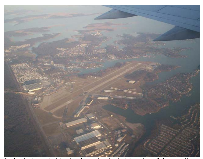
In developing priorities for the regional administration of the compliance program, FAA personnel should direct attention to those airports with the greatest potential for compliance problems and to issues that have the largest impact on aeronautical users. Variables such as the number of based aircraft and annual aircraft operations are valid indicators of the impact of a particular airport. The classification of the airport – such as being a reliever airport like the Martin State Airport in Maryland (above) – is another valid indicator of the role and the impact a particular airport has in the nation's airport system.

However, the FAA is in a position to assist airport sponsors in achieving voluntary compliance through guidance and counsel about the nature and applicability of federal compliance obligations affecting their airports.