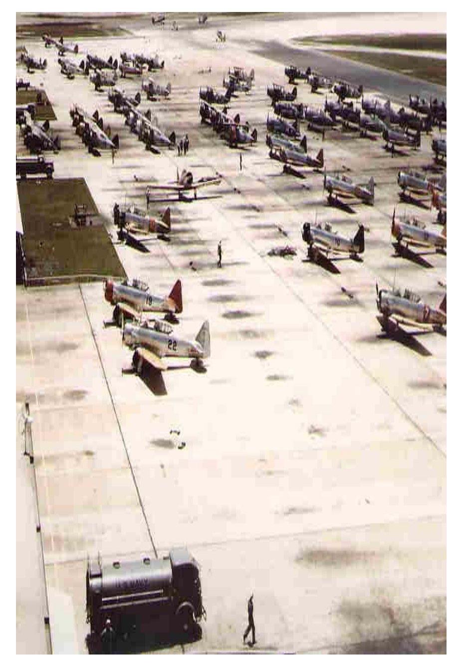
The sponsor will be considered in compliance if the physical condition of paving, lighting, grading, runway, marking, etc, meet applicable standards and if the sponsor is following realistic procedures to preserve these facilities in an acceptable condition. This requirement also applies to federally obligated airports in the national system that were previously military bases. In this photograph, we see the ramp of the Naval Air Station Miami in 1943. Today, this former Navy base is known as the Opa-Locka Airport near Miami, Florida.

The ANL lists obligated airports with egregious violations where the airport sponsor has been informally determined to be in noncompliance with its grant assurances and/or surplus property obligations as of a particular date.