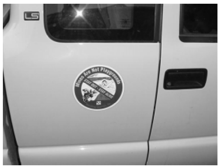
A magnet with the emblem like the SOSA sticker has been enlarged to approximately 10 inches in diameter and placed on several of the trucks to help remind anyone seeing the emblem of the hazards of abandoned mines for all ages trespassing on these properties.