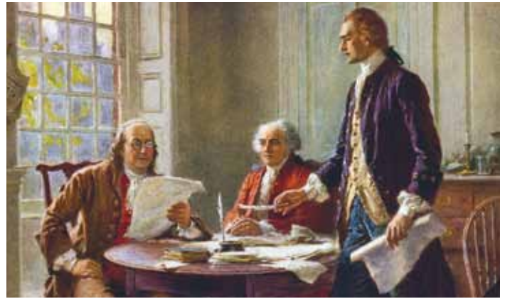
Benjamin Franklin, John Adams, and Thomas Jefferson in “Writing the Declaration of Independence, 1776,” by Jean Leon Gerome Ferris.

The Declaration of Independence lists three rights that the Founding Fathers considered to be natural and “unalienable.” They are the right to life, liberty, and the pursuit of happiness. These ideas about freedom and individual rights were the basis for declaring America’s independence. Thomas Jefferson and the other Founding Fathers believed that people are born with natural rights that no government can take away. Government exists to protect these rights. Because the people voluntarily give up power to a government, they can take that power back. The British government was not protecting the rights of the colonists, so the colonies took back their power and separated from Great Britain.