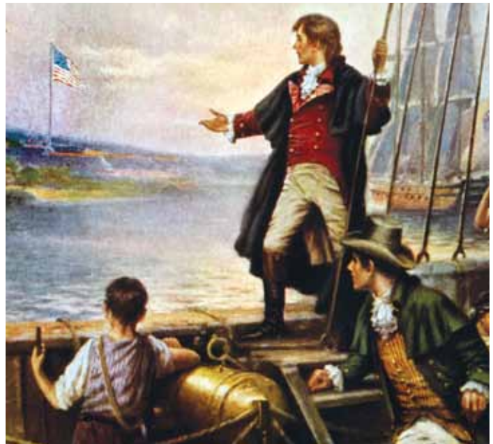
In "The Star-Spangled Banner," by Percy Moran, Francis Scott Key reaches toward the flag flying over Fort McHenry.

Many Americans celebrate national or federal holidays. These holidays often honor people or events in our American heritage. These holidays are "national" in a legal sense only for federal institutions and in the District of Columbia. Typically, federal offices are closed on these holidays. Each state can decide whether or not to celebrate the holiday. Businesses, schools, and commercial establishments may choose whether or not to close on these days. Since 1971, federal holidays are observed on Mondays except for New Year's Day, Independence Day, Veterans Day, Thanksgiving, and Christmas.