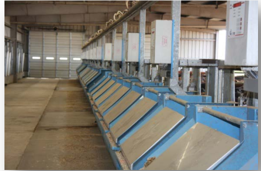
Feed Efficiency Facility

The single largest annual cost of beef production is feed. Increasing the efficiency with which animals convert nutrients in feed to edible product is a potential tool for increasing the profitability of animal production while decreasing the environmental impact of animal production. There is variation amongst animals in their efficiency of feed utilization. Scientists in the Nutrition Research Unit are using new technologies to identify efficient animals and develop genomic markers to allow for marker-assisted selection and management.