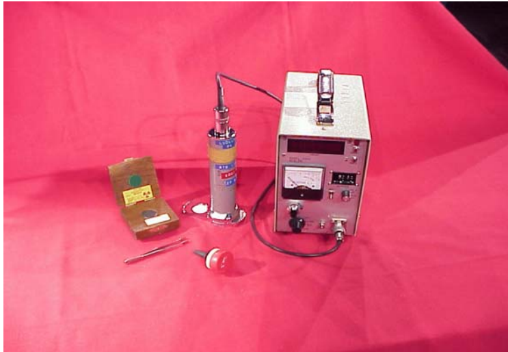
Figure 10A-1. Ludlum 2000 with accessories