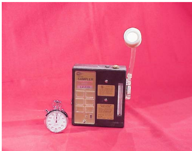
Figure 10-2. Sampling Set-up