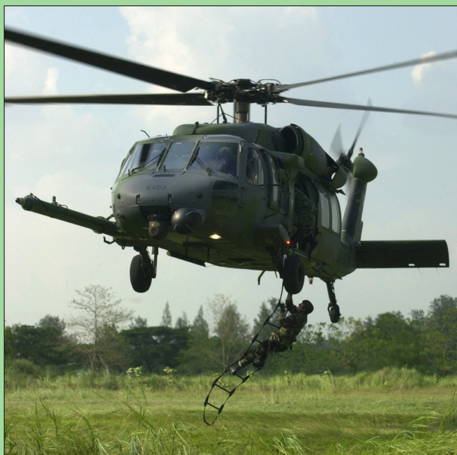
Service members train for a recovery mission.

Conferees represented subject matter experts spanning the entire spectrum of the personnel recovery mission area. This year saw significant interagency participation from ten different organizations, as well as international representatives from Australia, Canada and New Zealand.